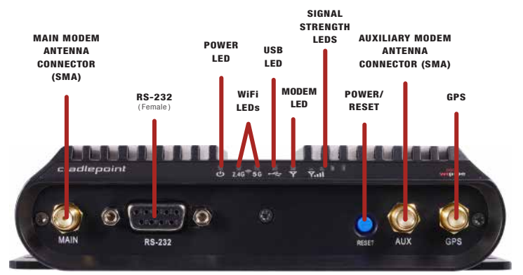
See Product Manual for suggested antenna positions