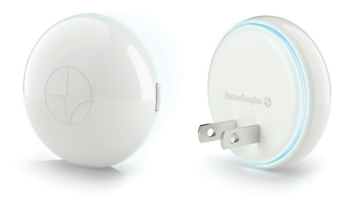
Distribute Repeater(s) as needed.

If you have already established a PowerView® Shade Network between a PowerView® Remote and PowerView shades, you should pair the Hub to the same network. To pair the Hub to the same network, open the PowerView® App and follow the prompts. The Hub LED will turn to solid BLUE, once the Hub has been paired to the PowerView Shade Network.