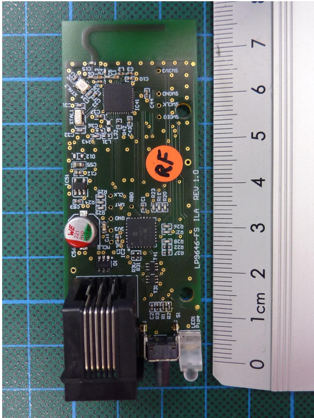
170813_e.JPG: Transceiver PV, PCB, top view