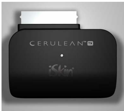
BT-TD01 TX for iPod