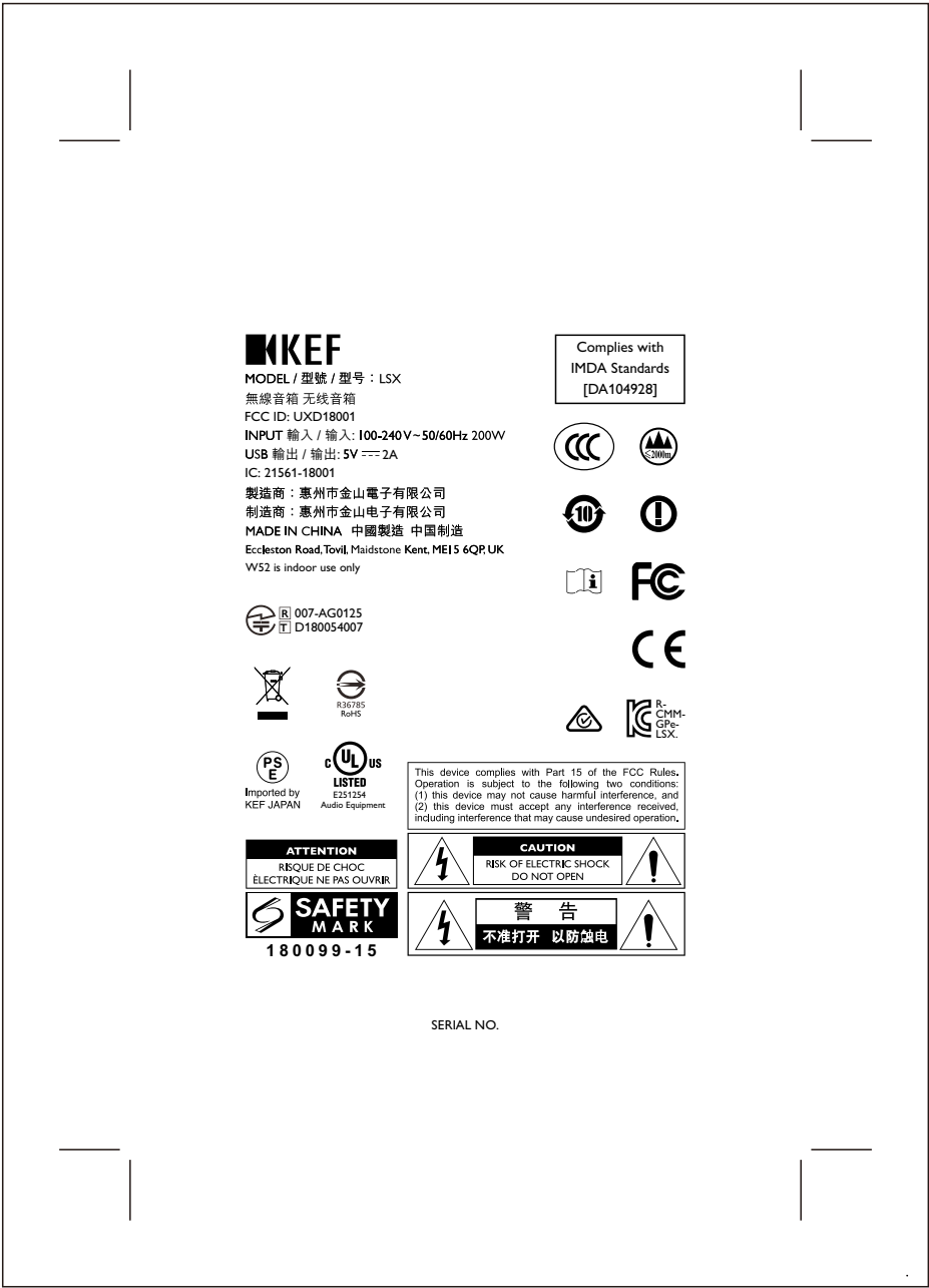
Rating label (Master) silkscreen film:

SERIAL NO: Laser Etched Font height: 1.2mm Font type: Gill Sans Nova Medium