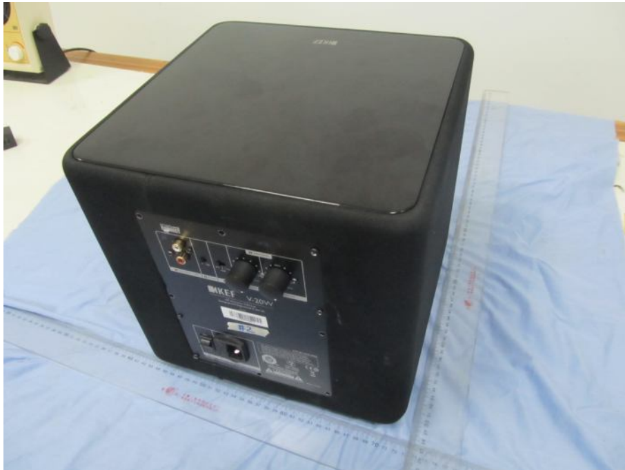
Enclosure of EUT