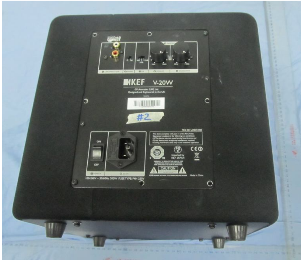
Interface of EUT