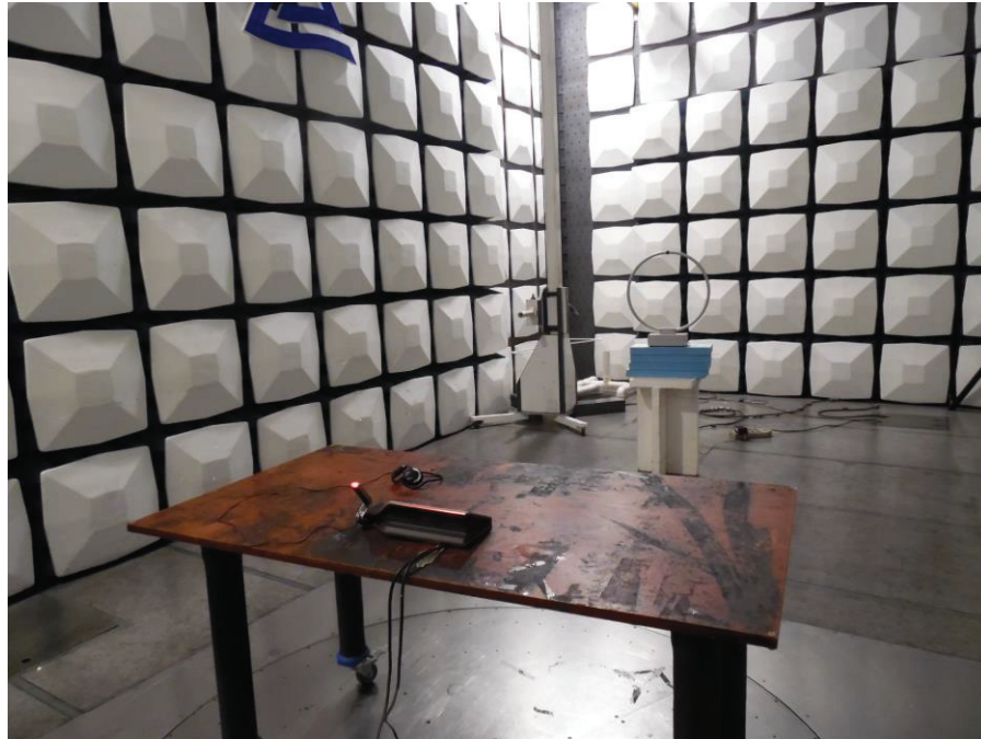
Photograph 1: Set-up for Spurious Emissions (Below 1GHz)