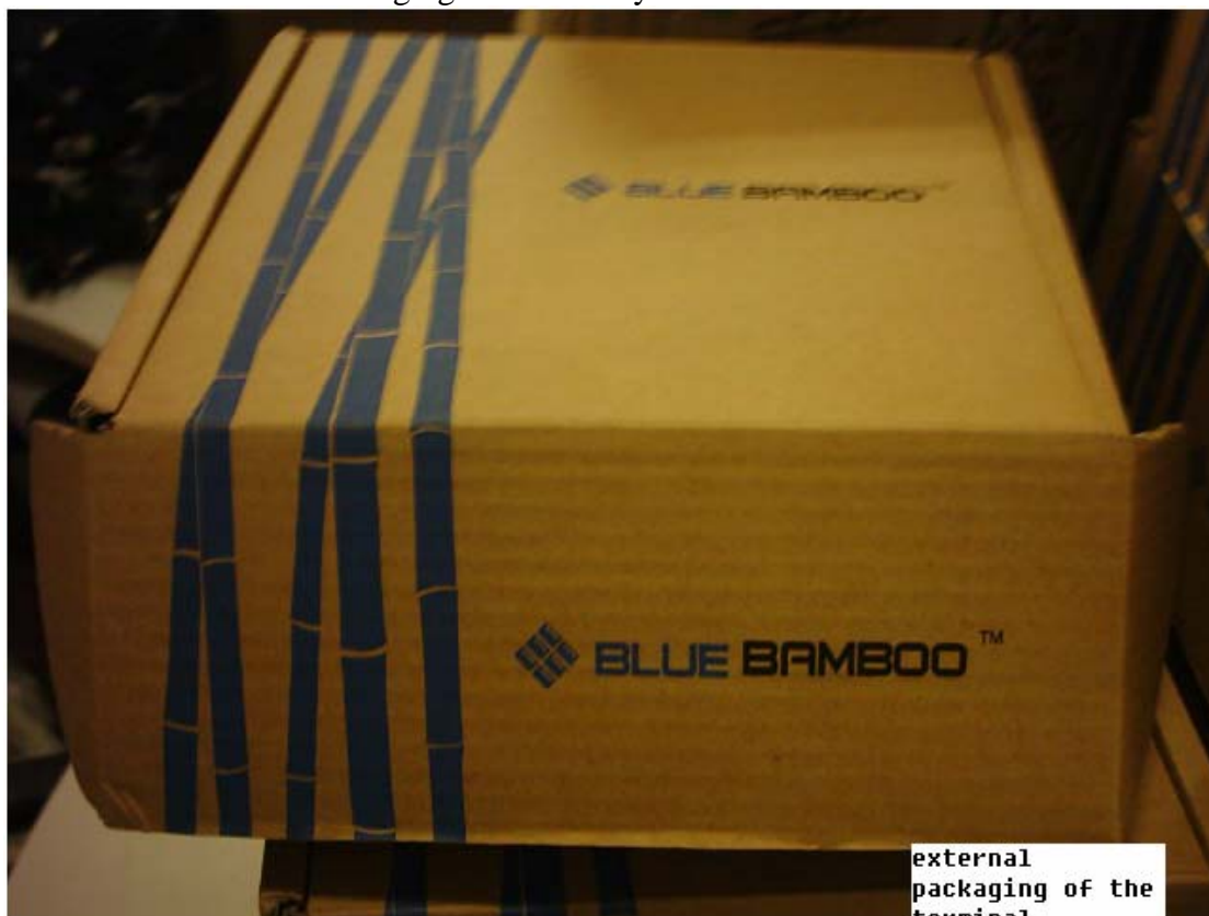
Picture2 external packaging of the terminal