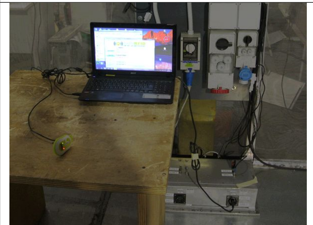
Fig. 6.1 Conducted Emissions Test Set-up