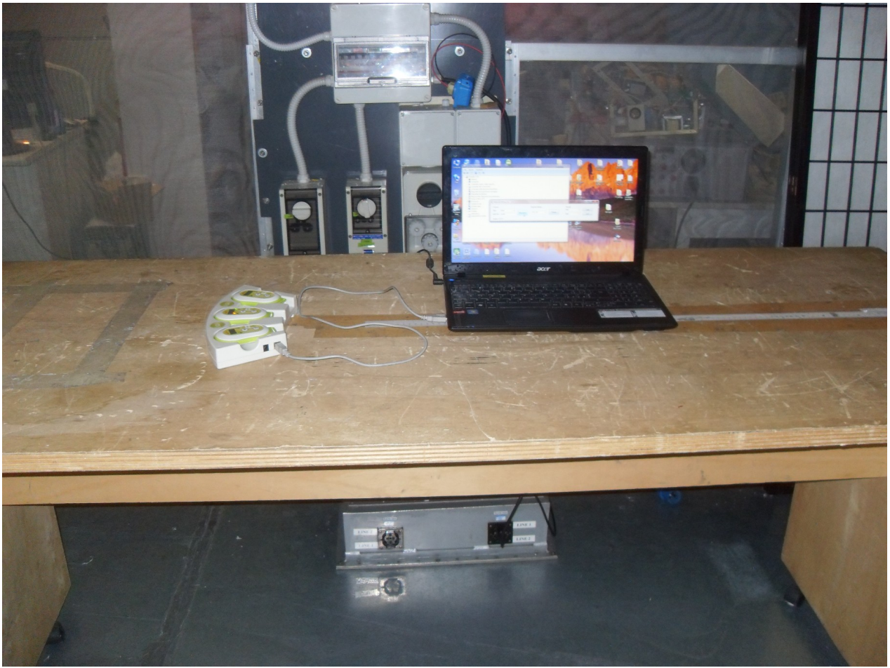
Fig. 6.1 Conducted Emissions Test Set-up