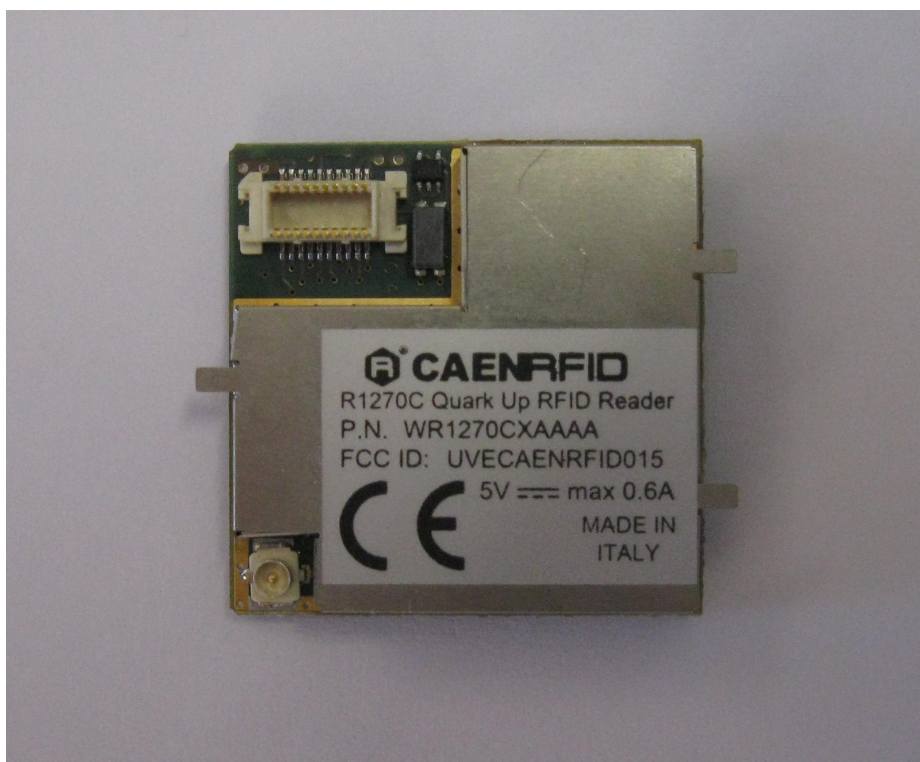
Figure 1 - R1270C Module Top View

Object: External photos of R1270C - Quark Up - 500mW UHF RFID Ultra Compact Module FCC ID: UVECAENRFID015