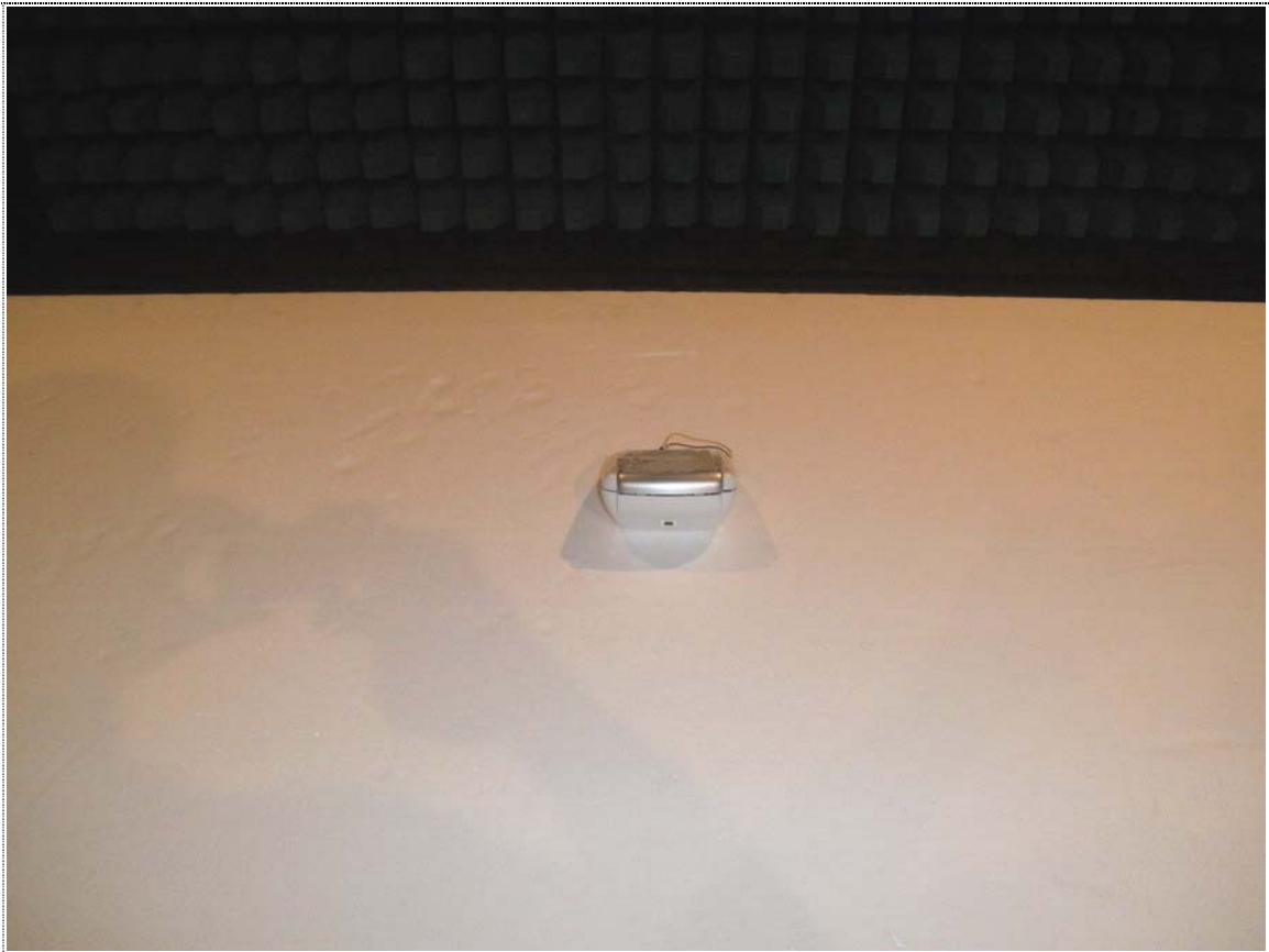
Rear View (Frequency Above 1 GHz)