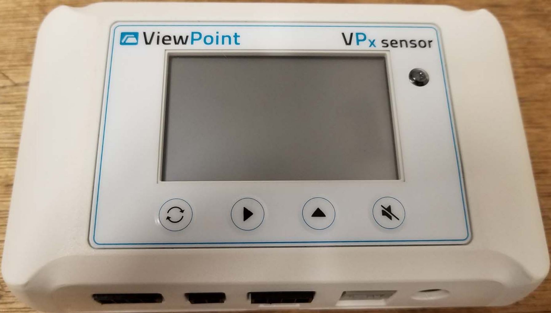
Top View of the EUT