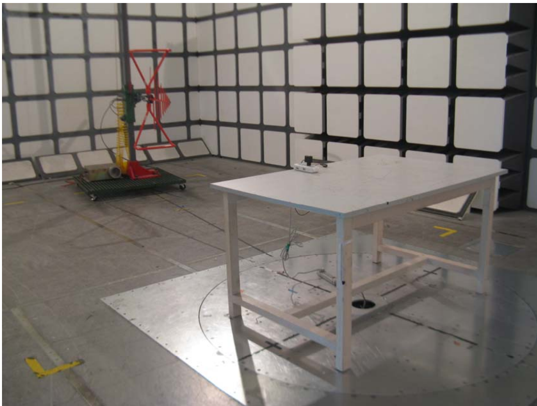
Charging Mode: Radiated Emissions - Rear View