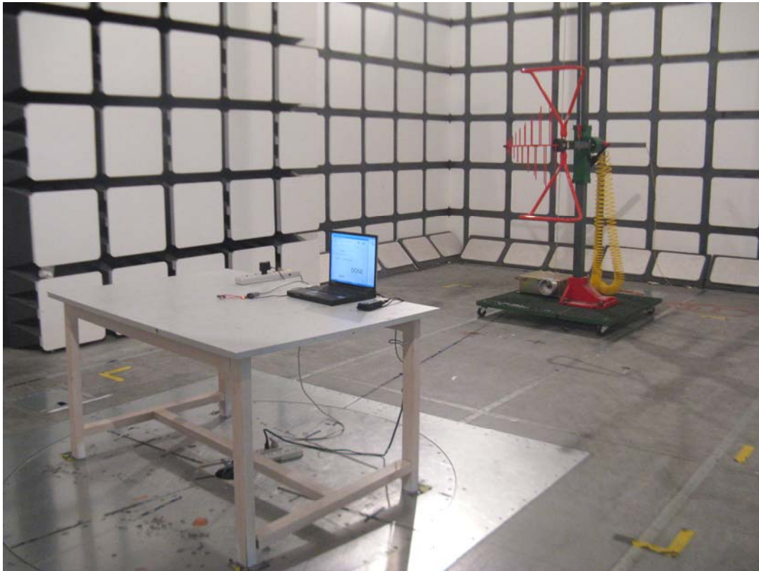
Transmitting Mode: Radiated Emissions - Rear View (30 MHz-1000MHz)