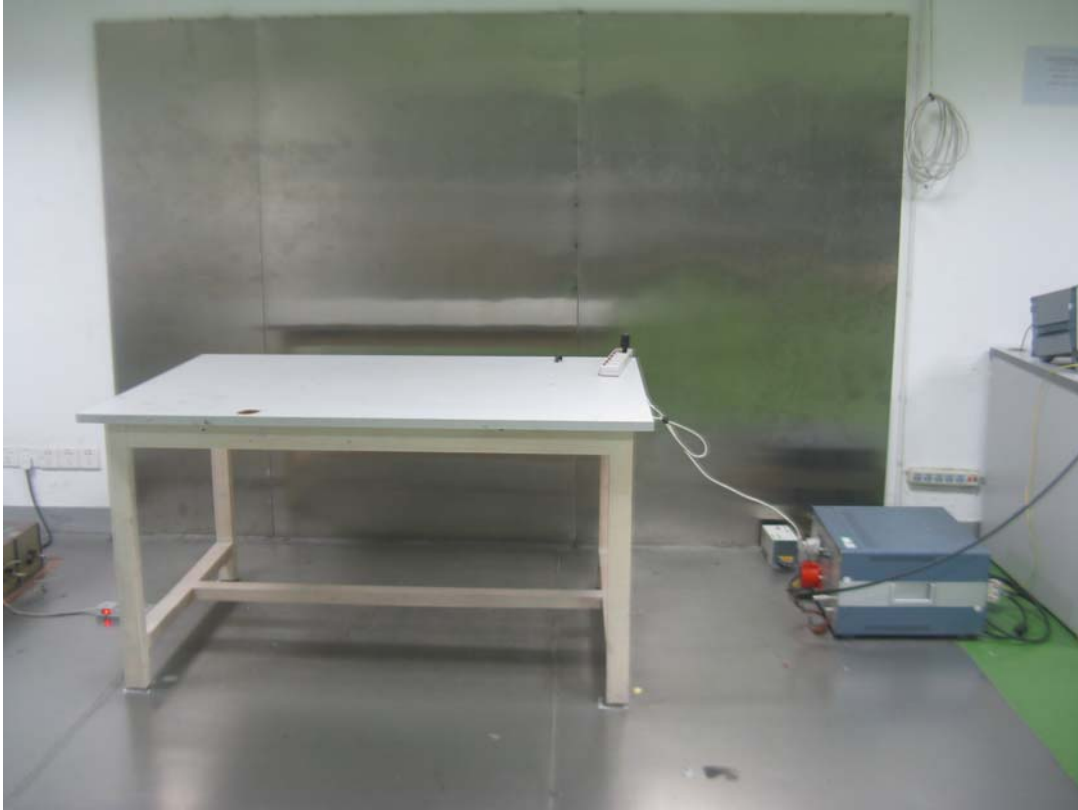
Charging Mode: Conducted Emissions - Side View