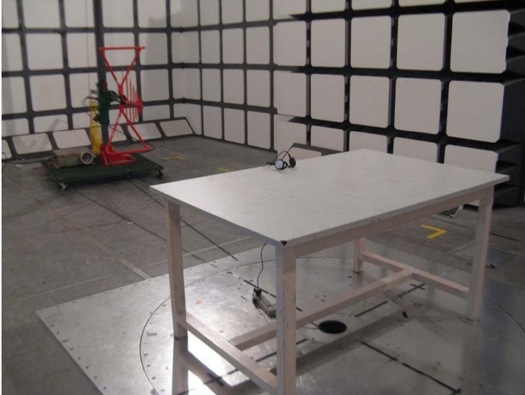
Charging Mode: Radiated Emissions - Rear View (30 – 1000 MHz)