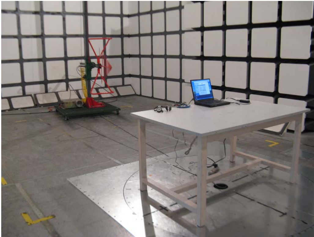
Transmitting Mode: Radiated Emissions - Rear View (30 – 1000 MHz)