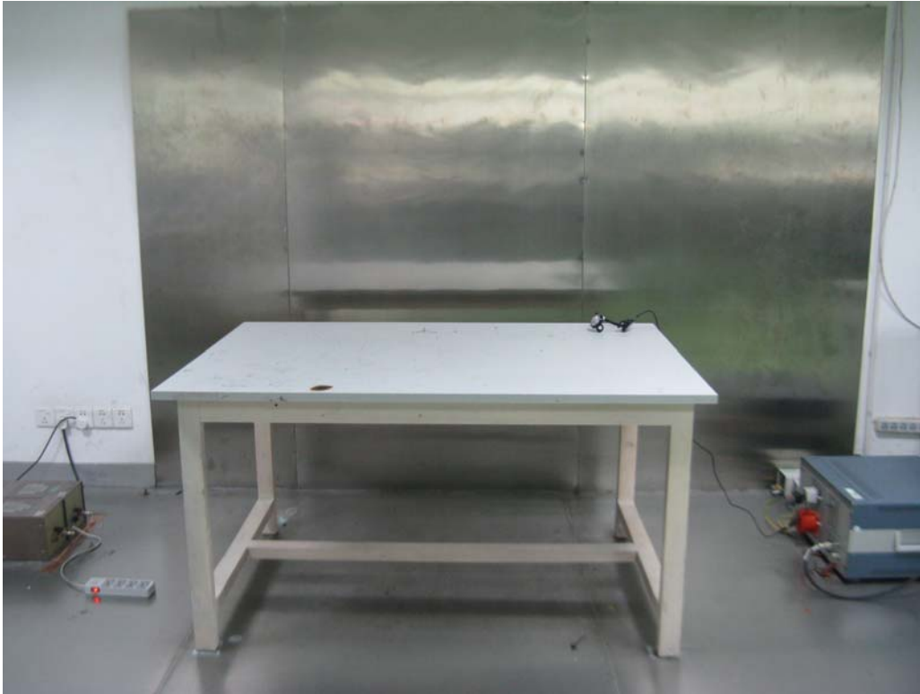
Charging Mode: Conducted Emissions - Side View