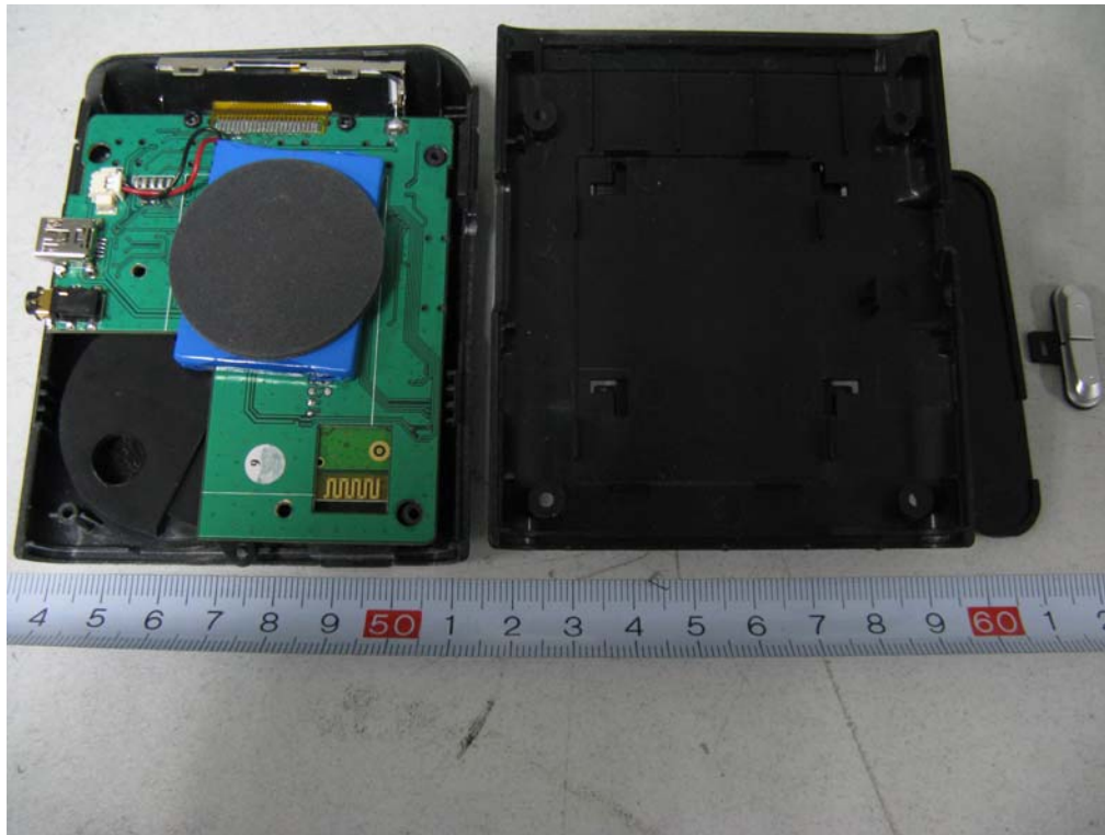
EUT- Main Board Components Top View