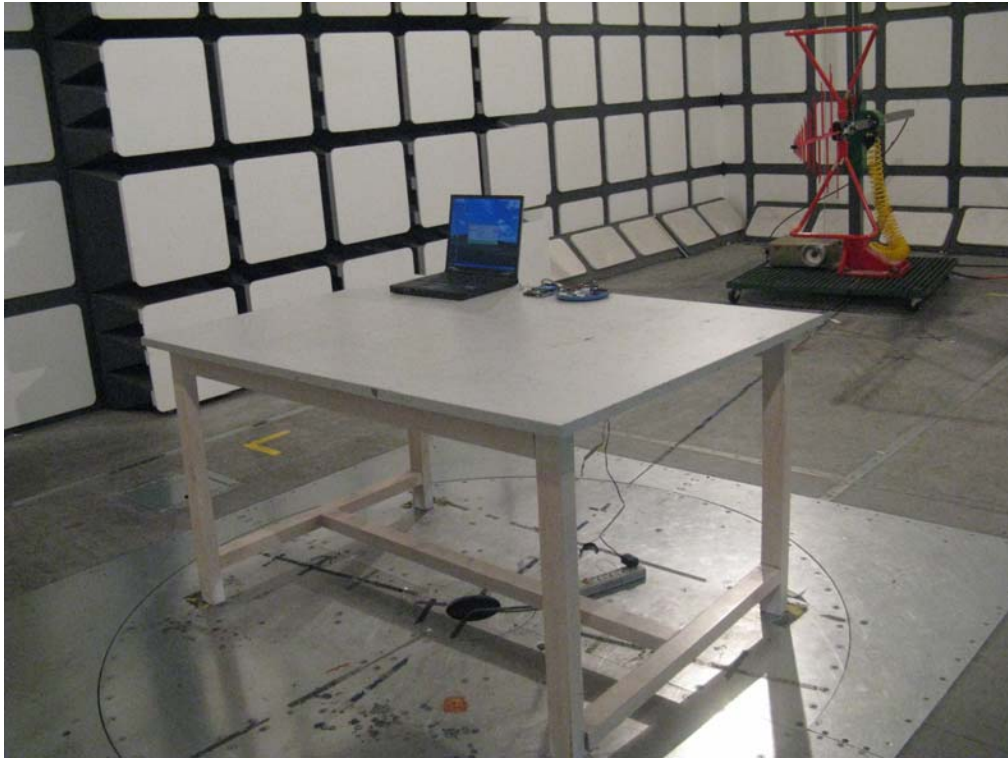
Radiated Emissions - Rear View (30 MHz-1000MHz)