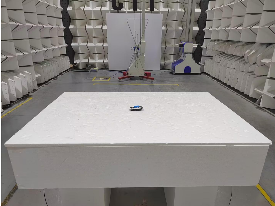
Radiated emission Test Setup-1 (30MHz~1GHz)