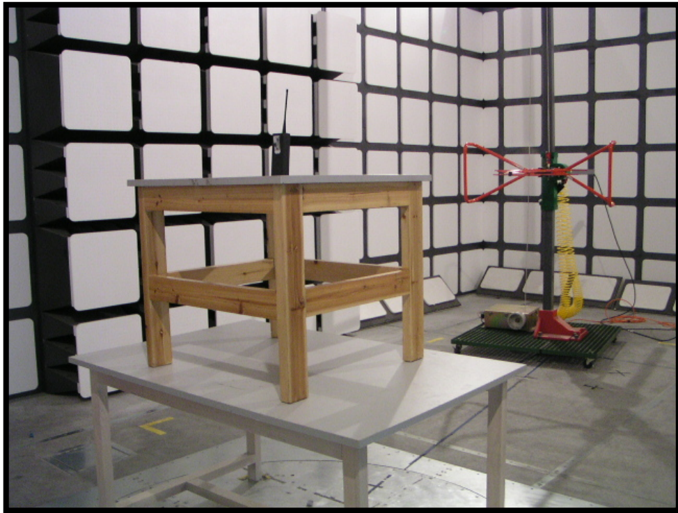
Radiated Emissions - Rear View (30-1000 MHz)