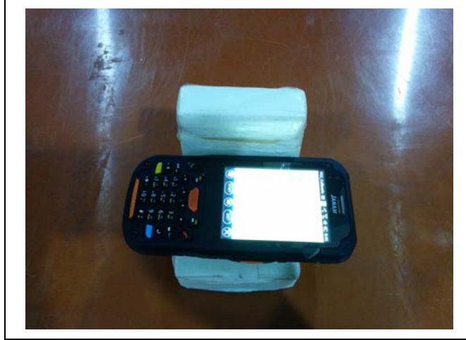
EUT Position: Y-axis