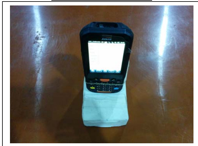
EUT Position: Z-axis