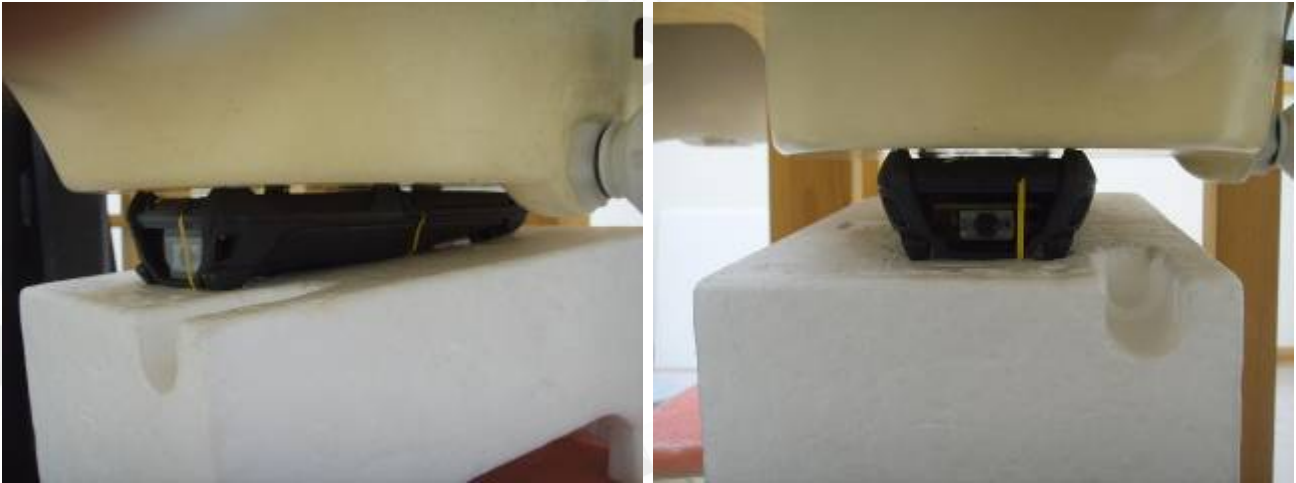
Fig.3 Front side of the EUT is paralleled and contact with flat phantom.