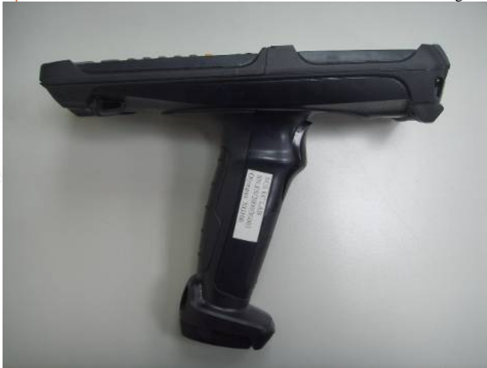
Fig.7 Right side view of EUT