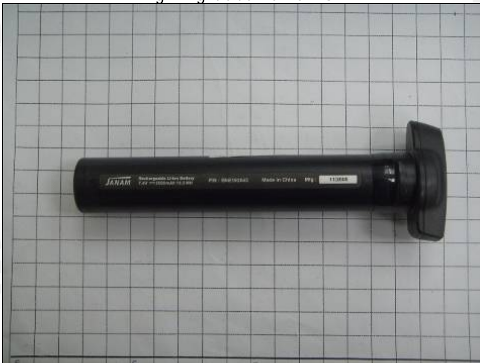
Fig.8 Front view of Battery

Unless otherwise stated the results shown in this test report refer only to the sample(s) tested and such sample(s) are retained for 90 days only. This test report cannot be reproduced, except in full, without prior written permission of the Company. 除非另有說明，此報告結果僅對測試之樣品負責，同時此樣品僅保留90天。本報告未經本公司書面許可，不可部份複製。