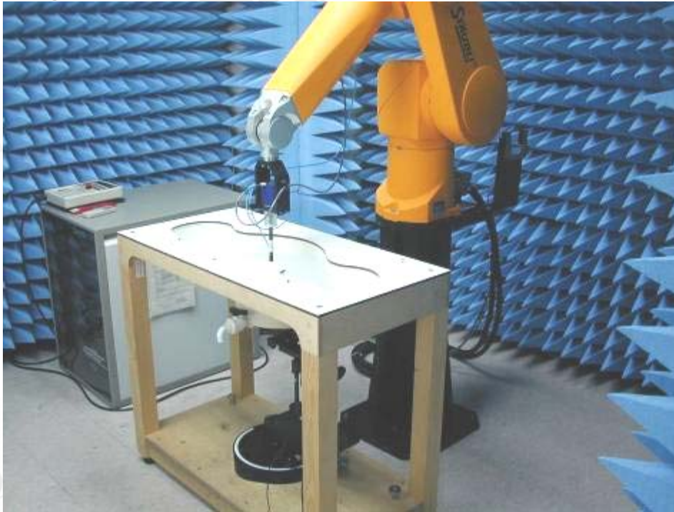
Fig.1 Photograph of the SAR measurement System