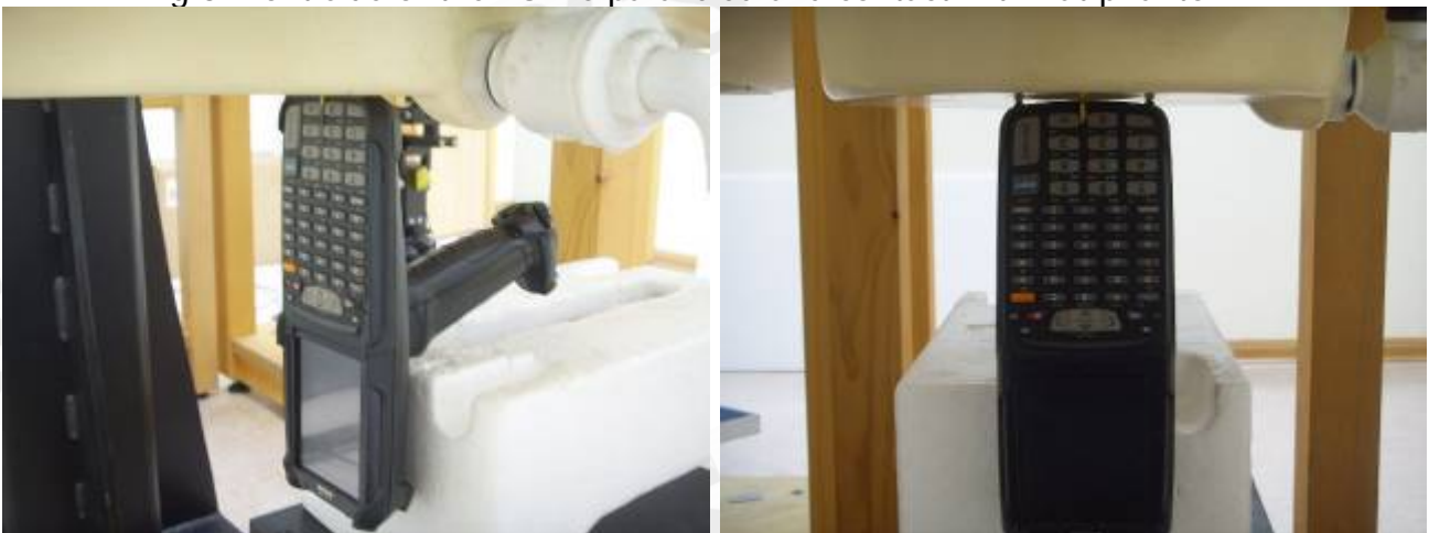
Fig.4 Bottom side of the EUT is paralleled and contact with flat phantom.

Unless otherwise stated the results shown in this test report refer only to the sample(s) tested and such sample(s) are retained for 90 days only. This test report cannot be reproduced, except in full, without prior written permission of the Company. 除非另有說明，此報告結果僅對測試之樣品負責，同時此樣品僅保留90天。本報告未經本公司書面許可，不可部份複製。