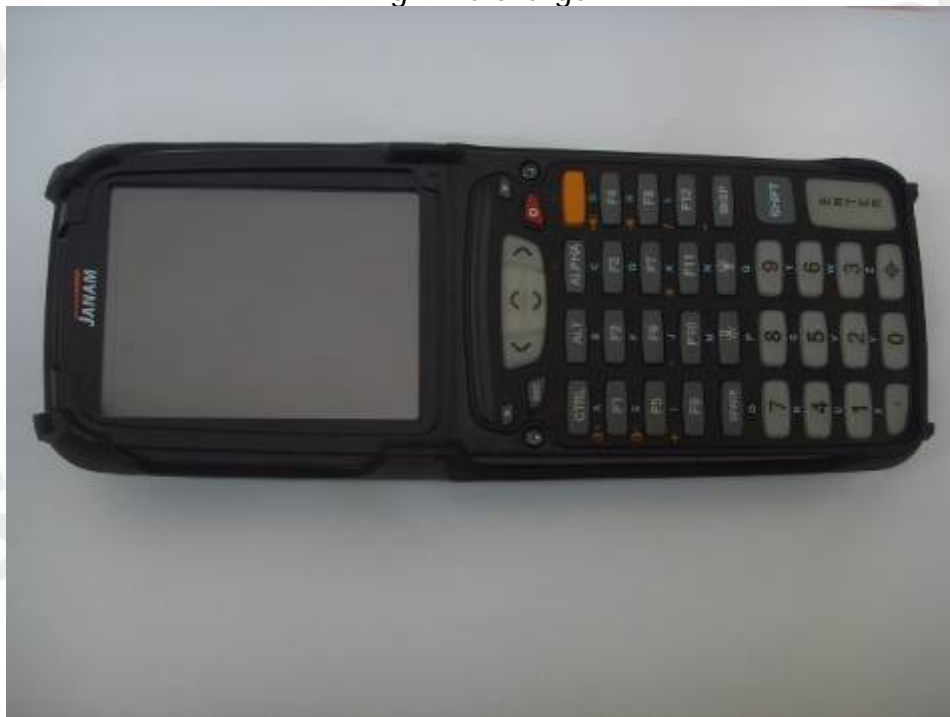
Fig.10 Second solution End of Report

Unless otherwise stated the results shown in this test report refer only to the sample(s) tested and such sample(s) are retained for 90 days only. This test report cannot be reproduced, except in full, without prior written permission of the Company. 除非另有說明，此報告結果僅對測試之樣品負責，同時此樣品僅保留90天。本報告未經本公司書面許可，不可部份複製。