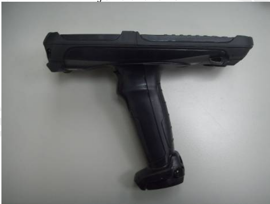
Fig.6 Left side view of EUT

Unless otherwise stated the results shown in this test report refer only to the sample(s) tested and such sample(s) are retained for 90 days only. This test report cannot be reproduced, except in full, without prior written permission of the Company. 除非另有說明，此報告結果僅對測試之樣品負責，同時此樣品僅保留90天。本報告未經本公司書面許可，不可部份複製。