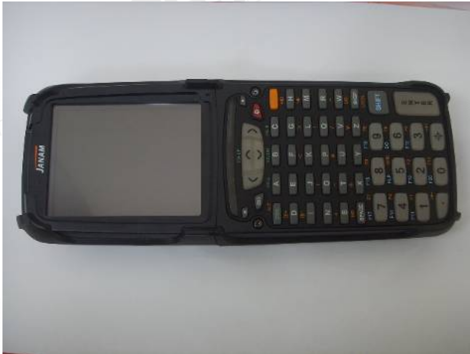
Fig.5 Front view of EUT