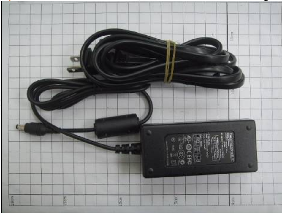
Fig.9 AC charger