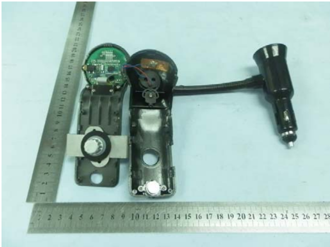
EUT – PCB View