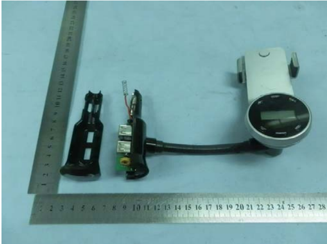
EUT- Uncover view