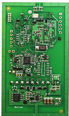
VIEW - PCB BOTTOM ▲