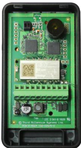
VIEW - REVERSE ▲ internal view assembled + PCB top view (reader unpotted)