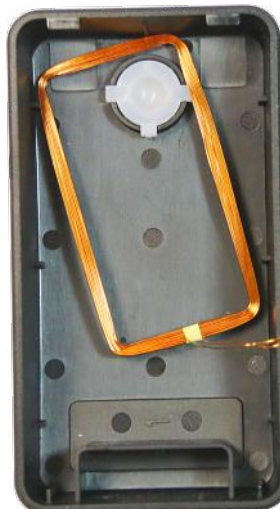
VIEW - REVERSE ▲ internal view part assembled + ANTENNA