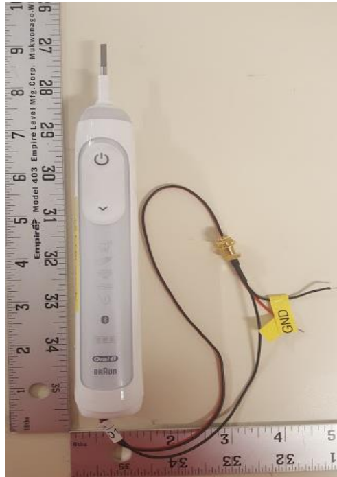
Figure B1. Conducted DUT