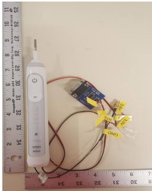
Figure B2: DTM DUT