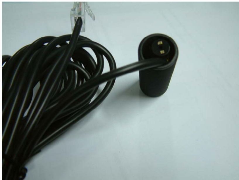
PCB in housing with cable connected