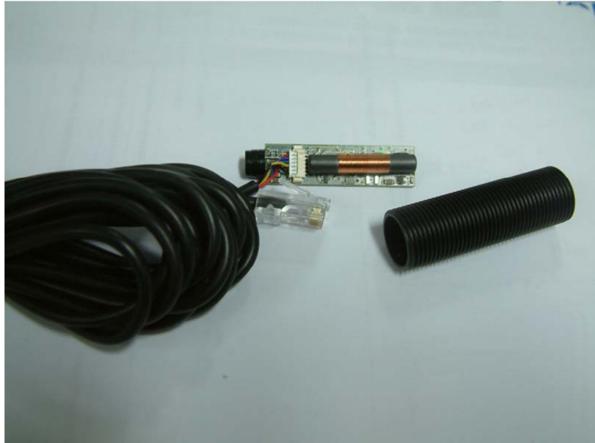
PCB with attached cable, coil on ferrite, and housing.