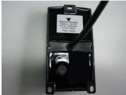
Exhibit 1: Label location information

Labels are located on the back of the reader.