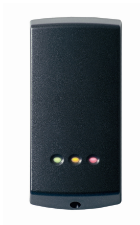
Front view – with cover on