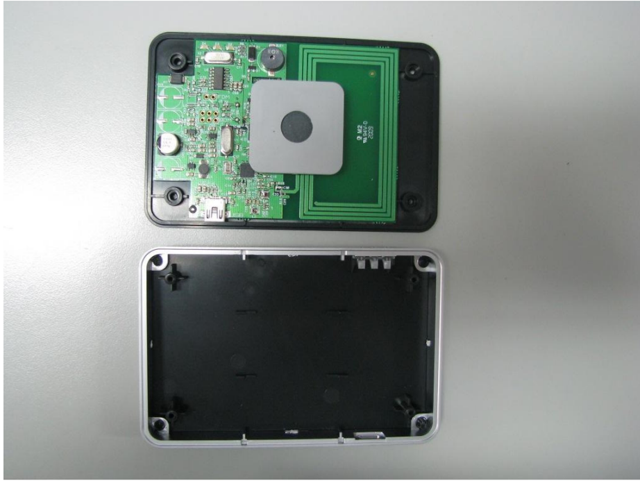
PCB in housing