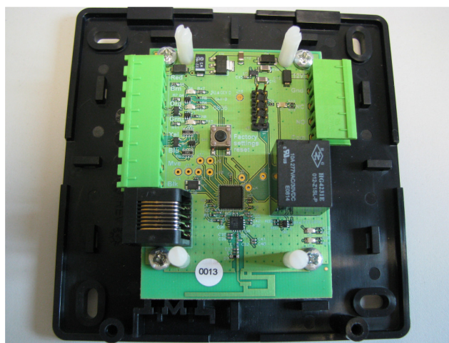
Wireless Reader Module PCB in housing