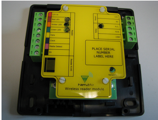
Wireless Reader Module with connectors and wiring label attached, in housing