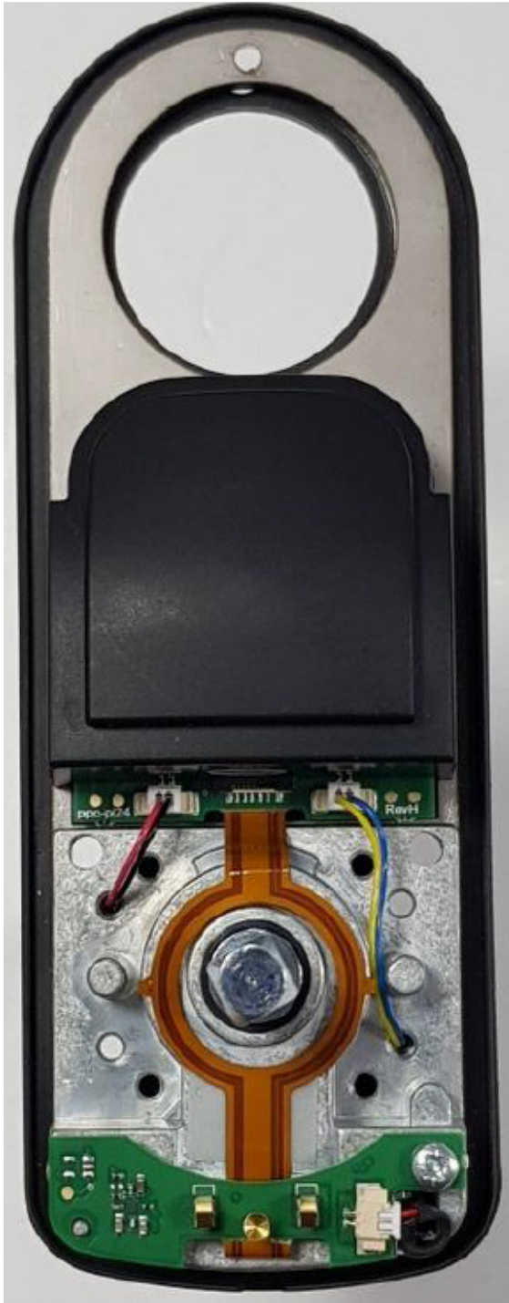
Internal view of PCB