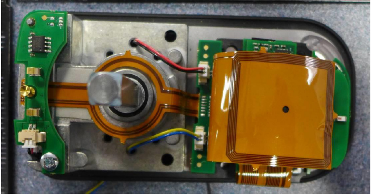
Internal view of PCB