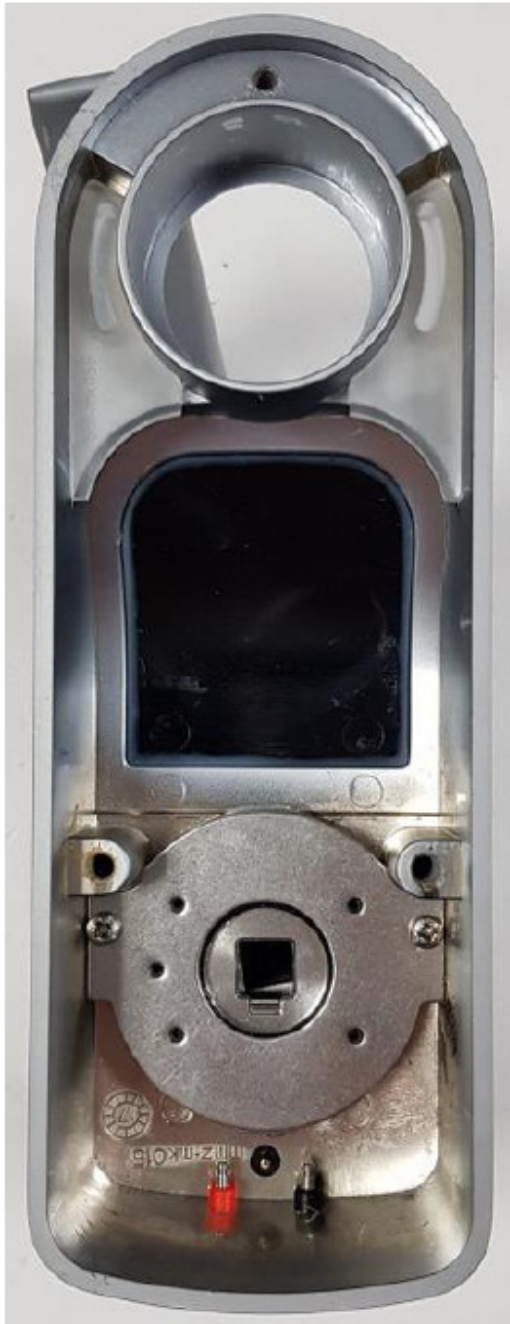
Front enclosure internal view