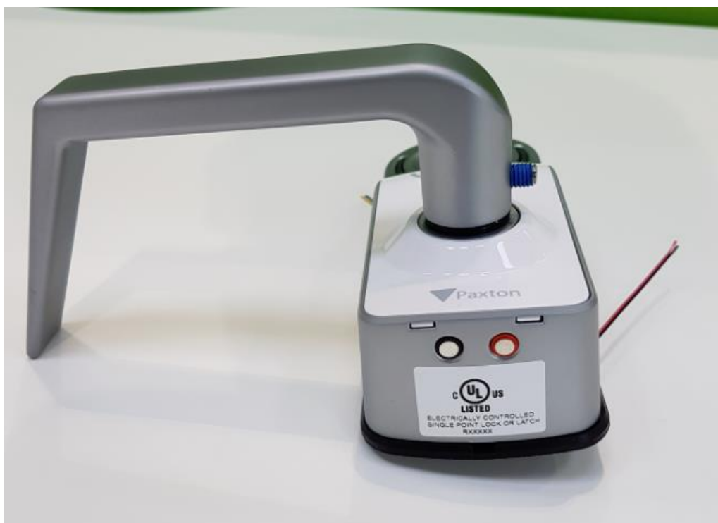
Figure 1 - photo of position of label on product (Print on label not correct)

NOTE RXXXXX is to denote the UL file number for the Fire rating report from UL