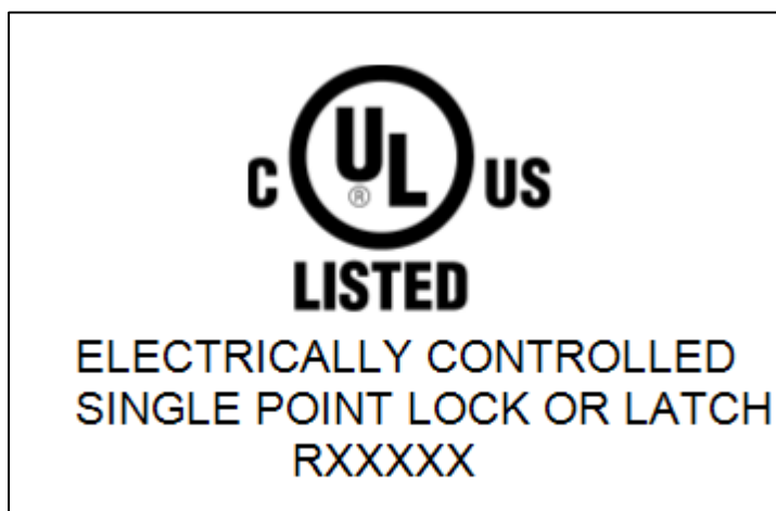
Figure 4 - Fire Label - ils-z330 Size: 30x20mm