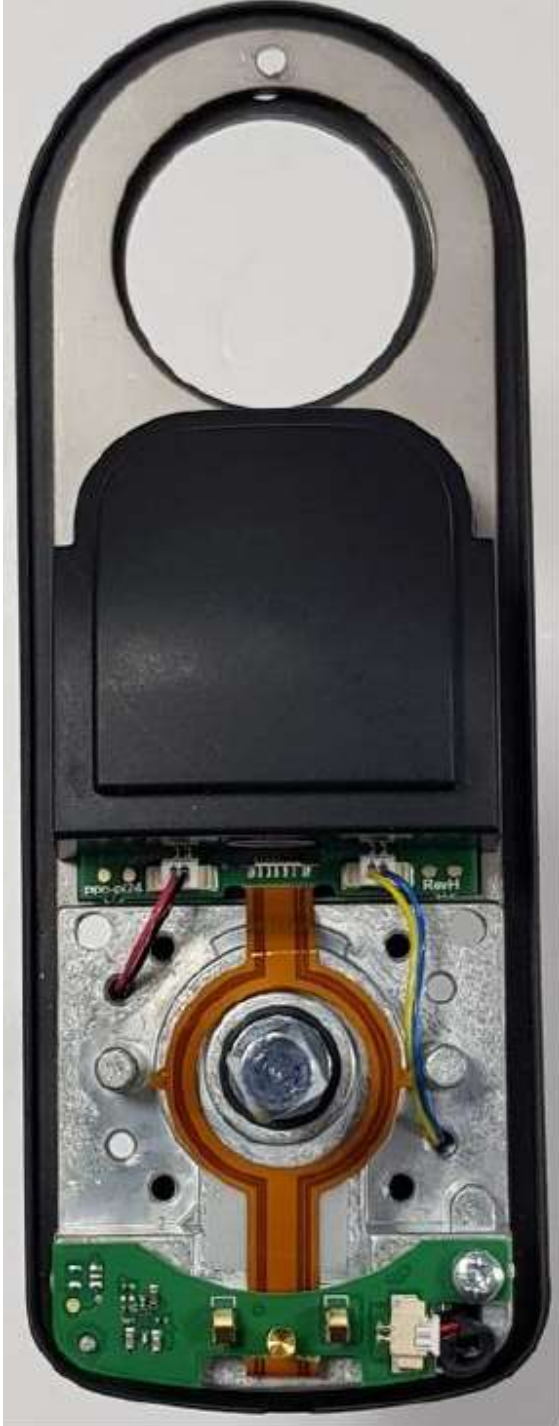
Internal view of PCB