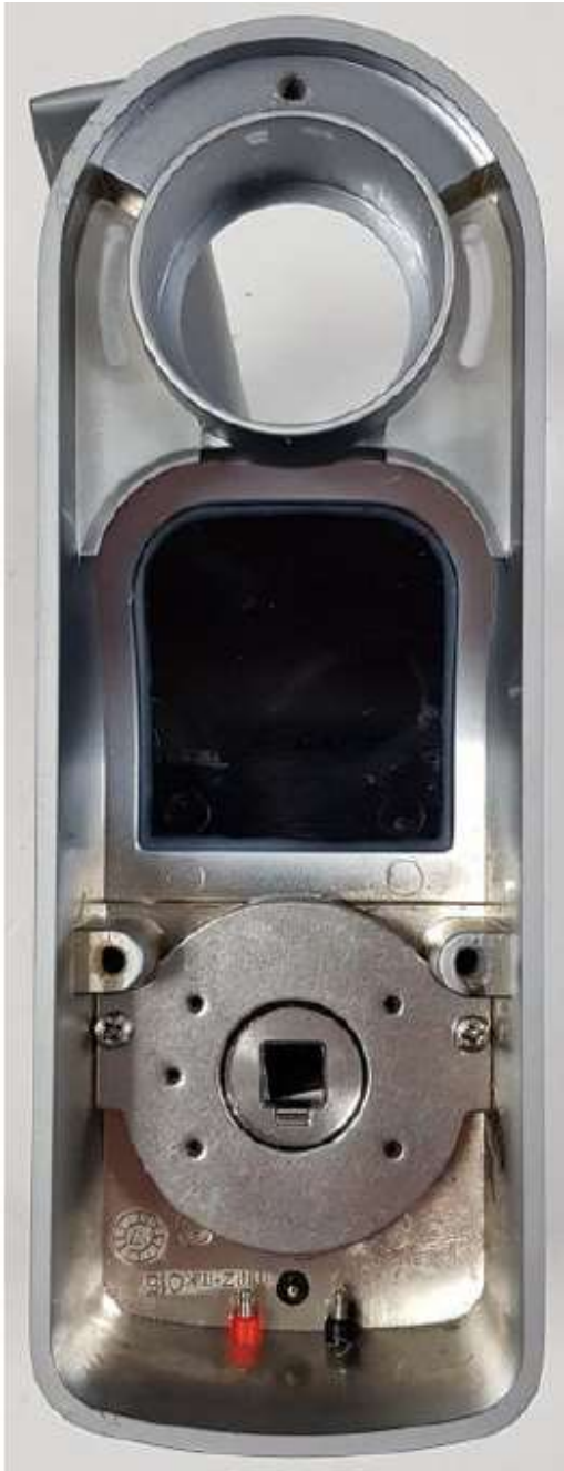
Front enclosure internal view