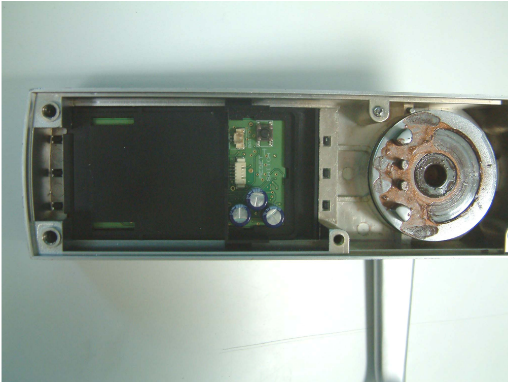
PCB and coil former inside metal housing