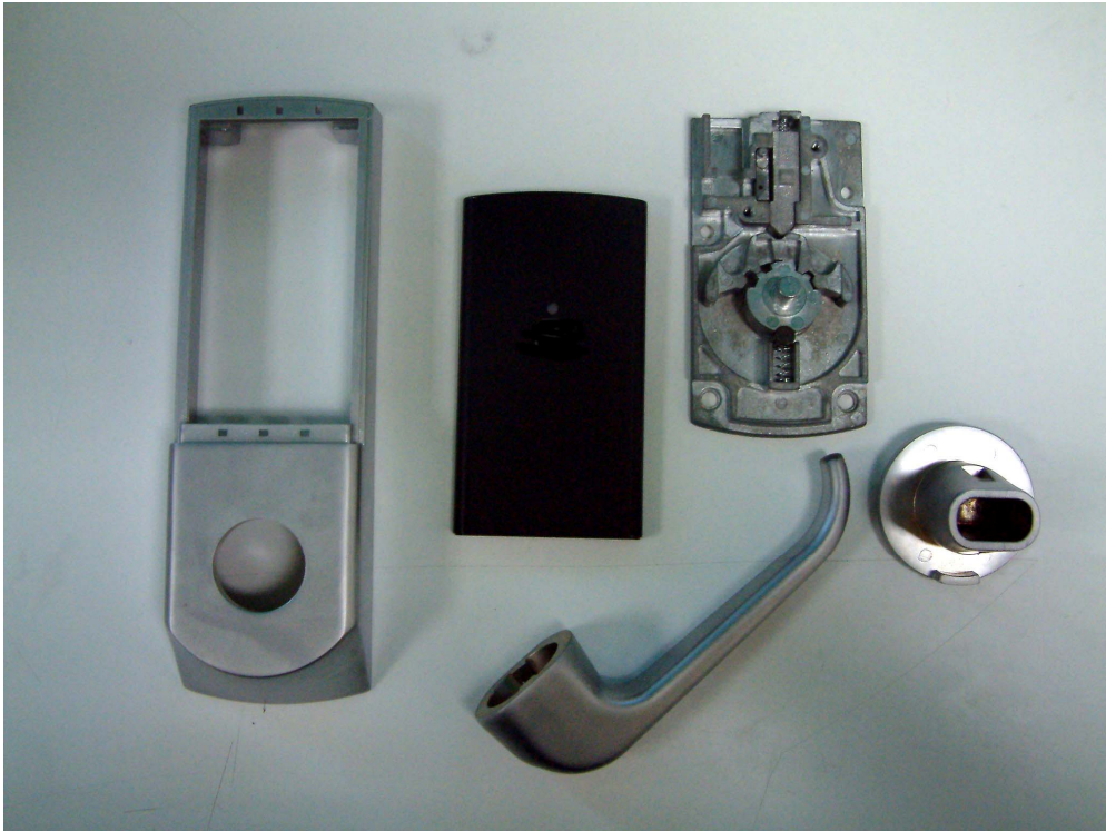
Door entry unit – main parts