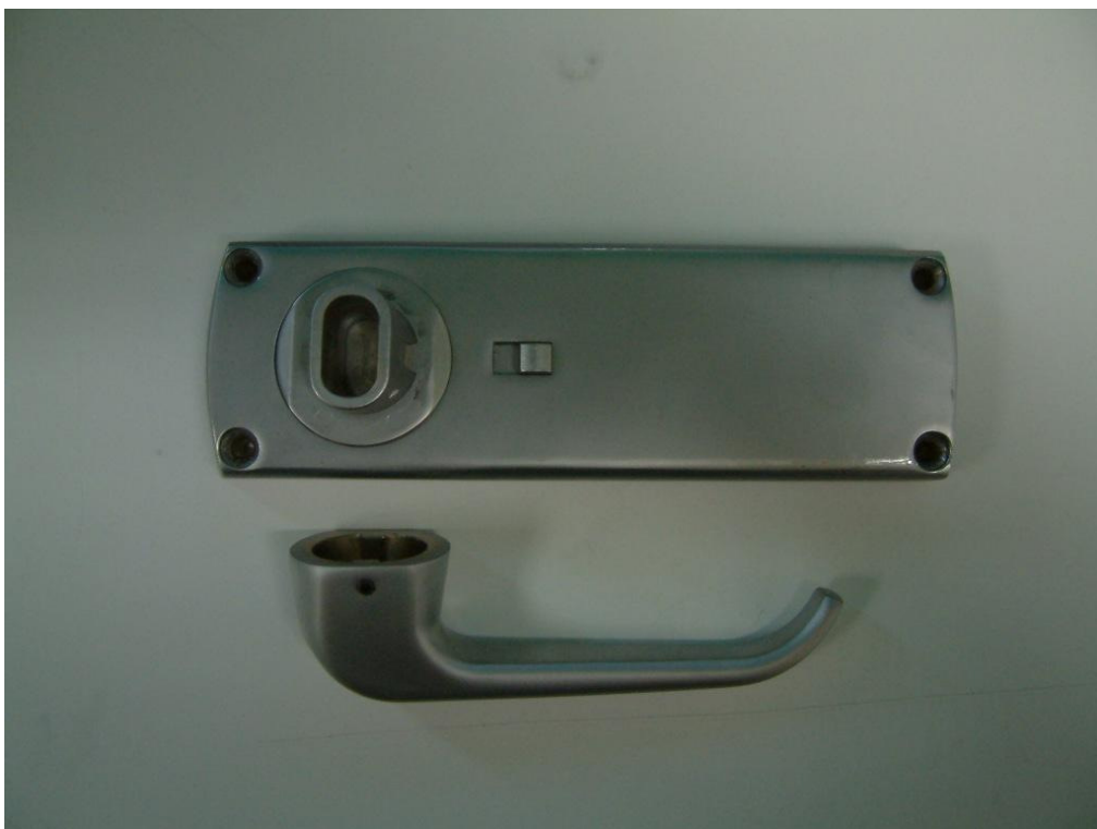
Door exit unit – main parts