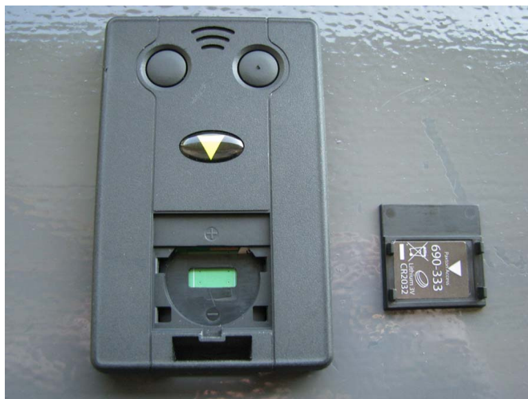
Sealed housing with battery and cover removed