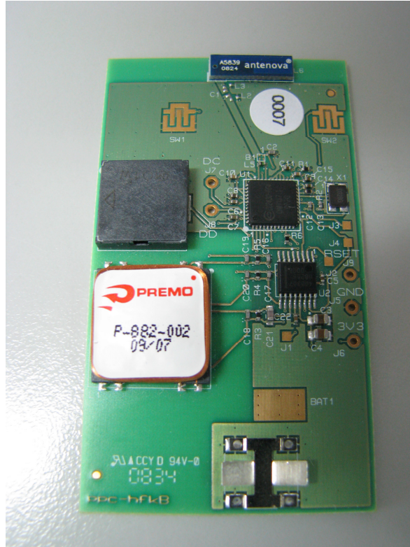
PCB - top view