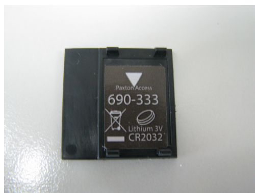
Cover - inner ratings label