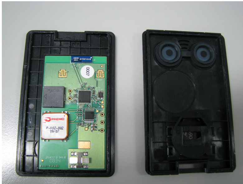
Housing and PCB