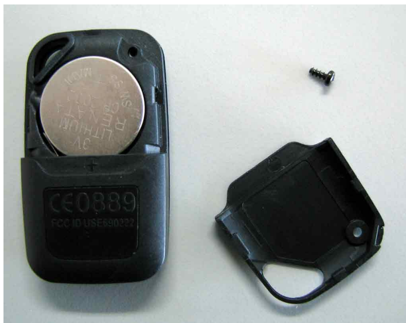
Seal housing with battery connected and cover removed