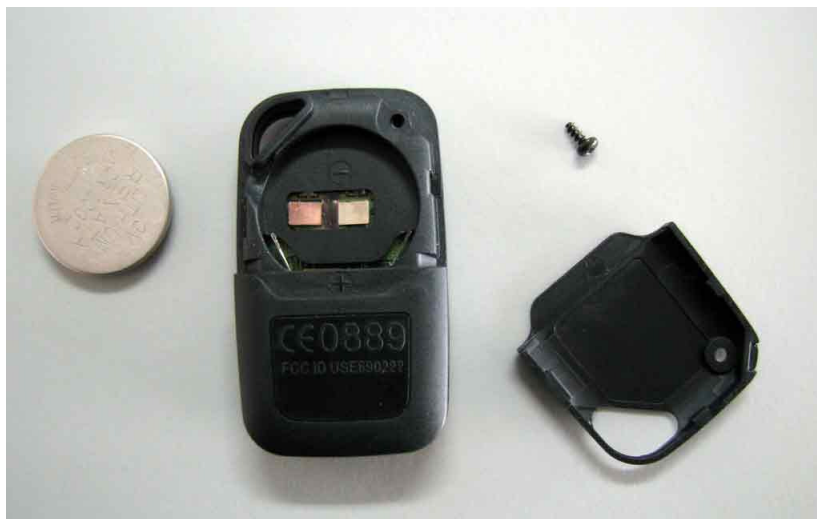
Sealed housing with battery and cover removed