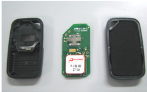
Housing and PCB