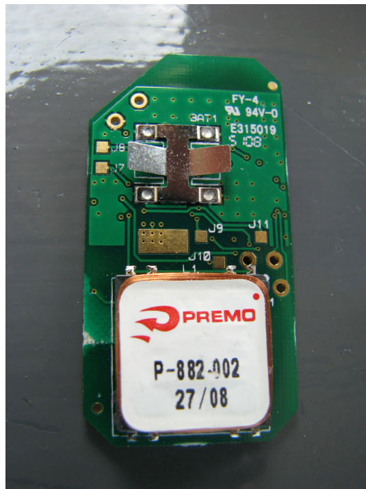
PCB - bottom view