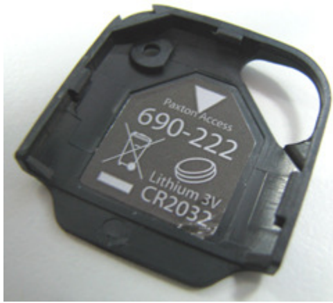
Cover – inner ratings label