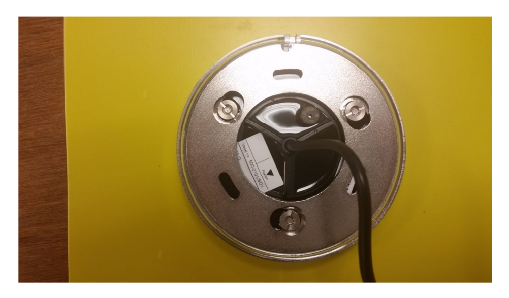
Figure 4 - Rear view with mounting plate