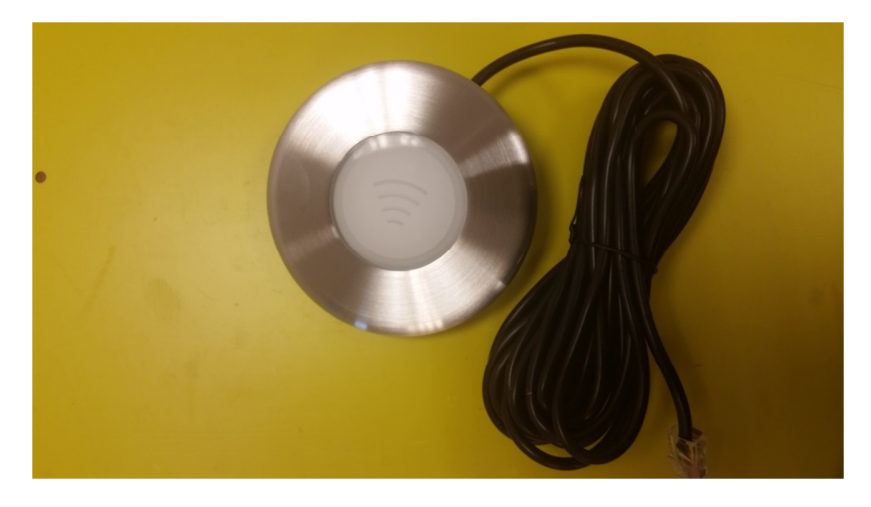
Figure 1 – Front of Reader