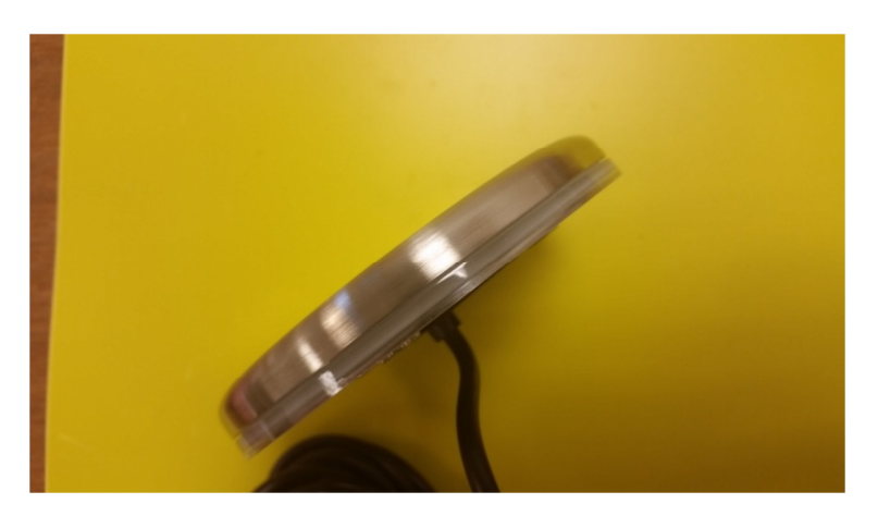
Figure 2 – Side - Top - Bottom view of Reader