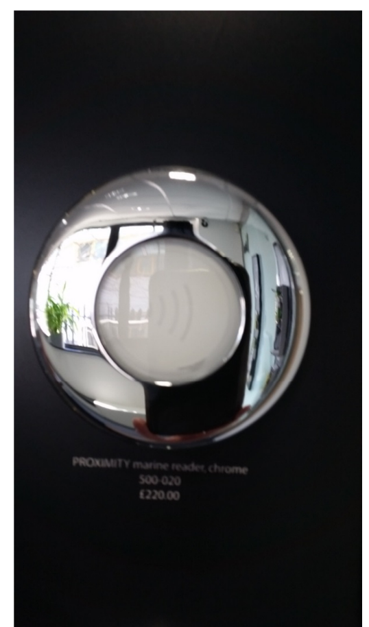
Figure 6 - External photo of Marine reader (Chrome)-Sales code: 500-020-US

5 April 2016 Product: Marine reader (Chrome) Part No. 500-020-US FCC ID: USE500010 IC_ID:10217A-500010