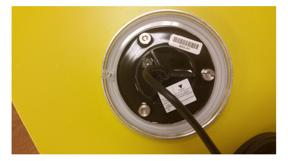
Figure 3 – Rear view of Reader