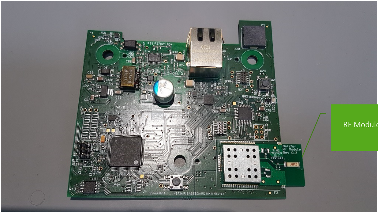
Main PCA and RF Module (Top View)