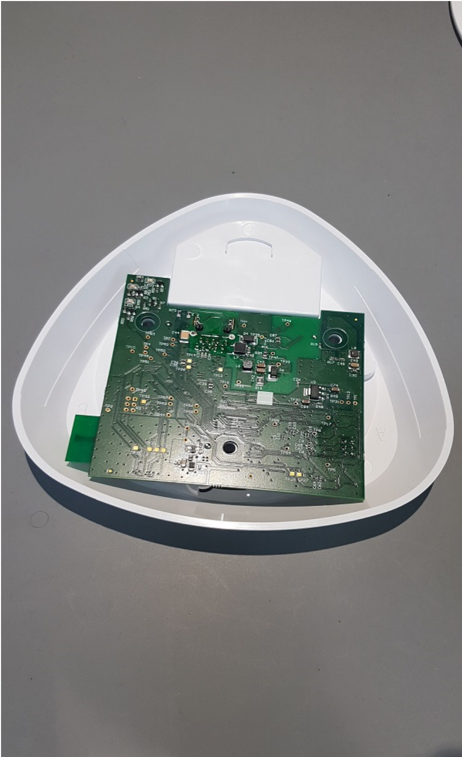
Top Lid Removed