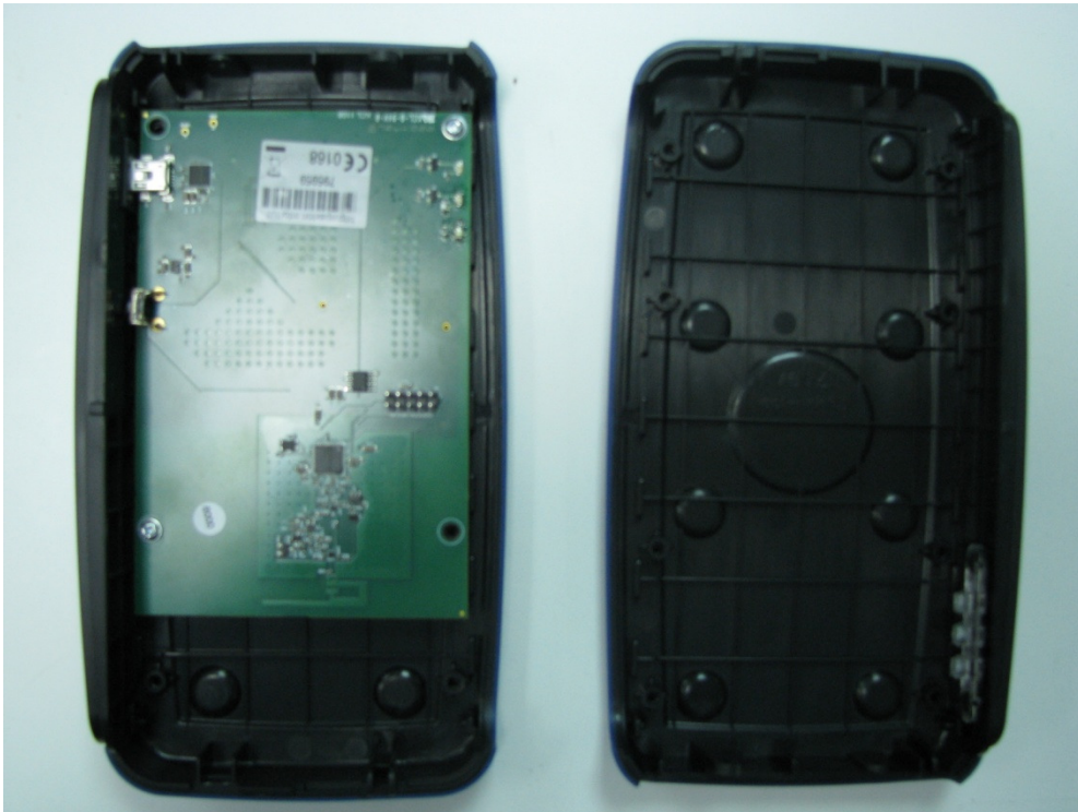
PCB inside housing