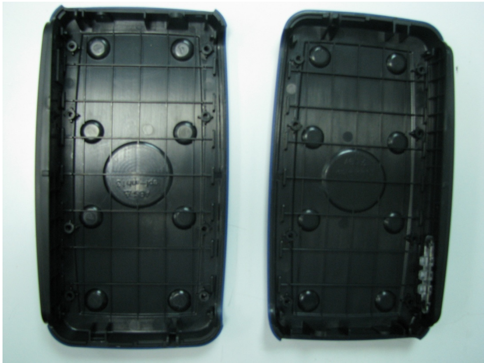
Inside housing, with PCB removed