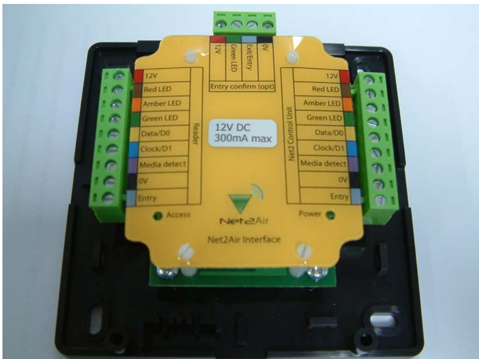
PCB mounted to housing base, with wiring label & connectors