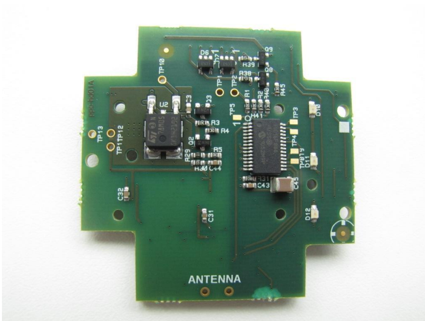
PCB bottom view