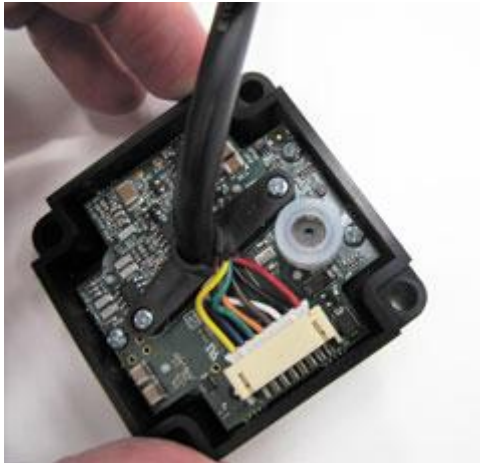
PCB in housing with cable attached