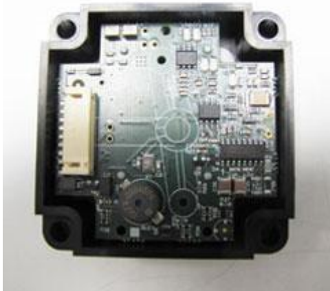
PCB and coil former in housing