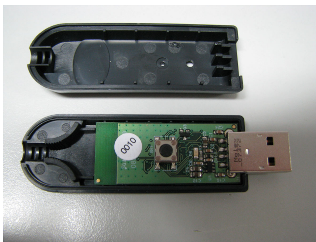
PCB in housing