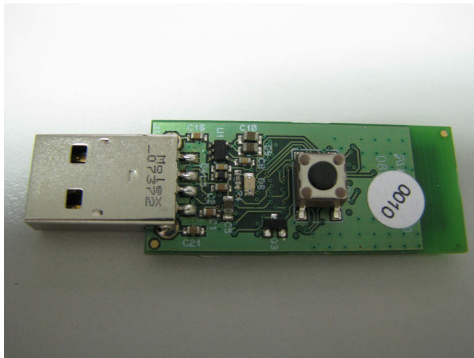
PCB – back view