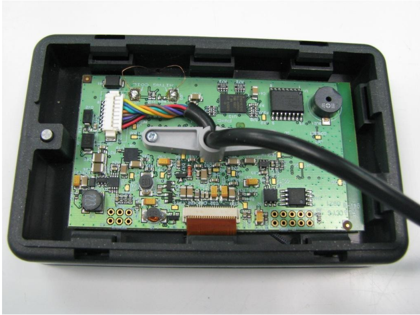
PCB in housing – unpotted