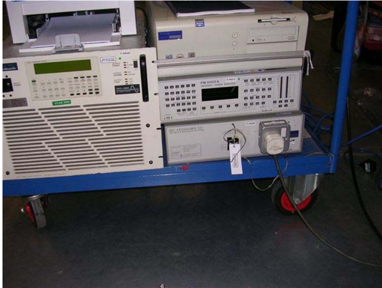
120 V, 60 Hz supply