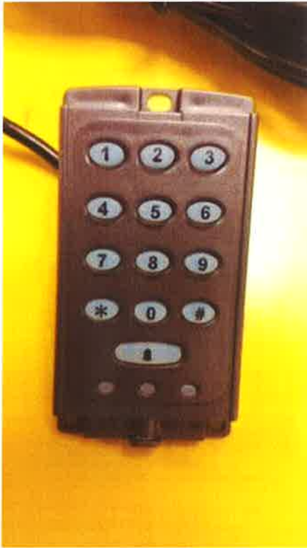
Figure 2 – Front of Reader