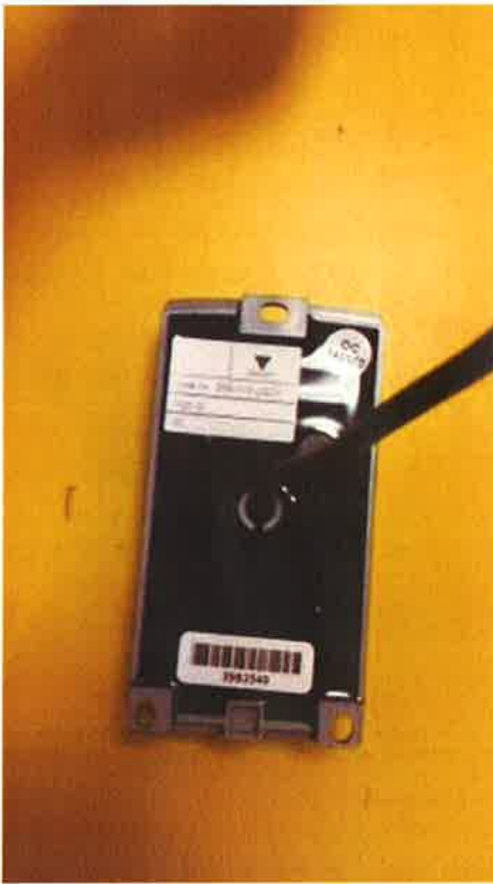
Figure 3 – Rear view of Reader