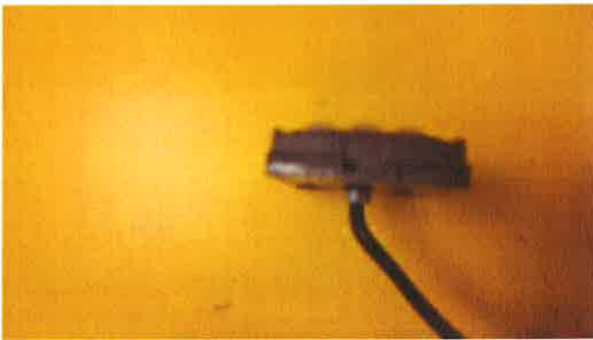
Figure 6 – Top view of reader