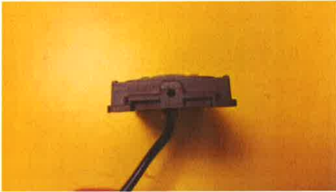
Figure 5 – Bottom view of reader