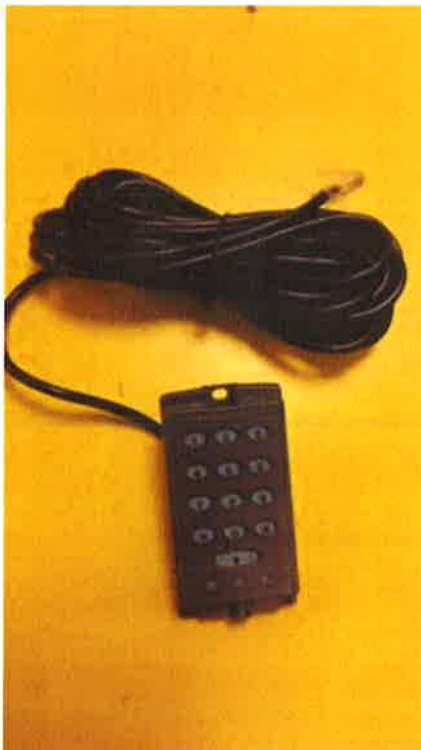
Figure 1 - Reader with cable attached

Product: Proximity reader – KP50 Part No. 355-110-US FCC ID: USE355110 IC ID: 10217A-355110