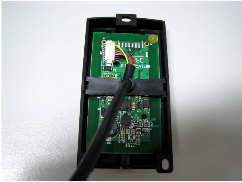
PCB in housing – unpotted