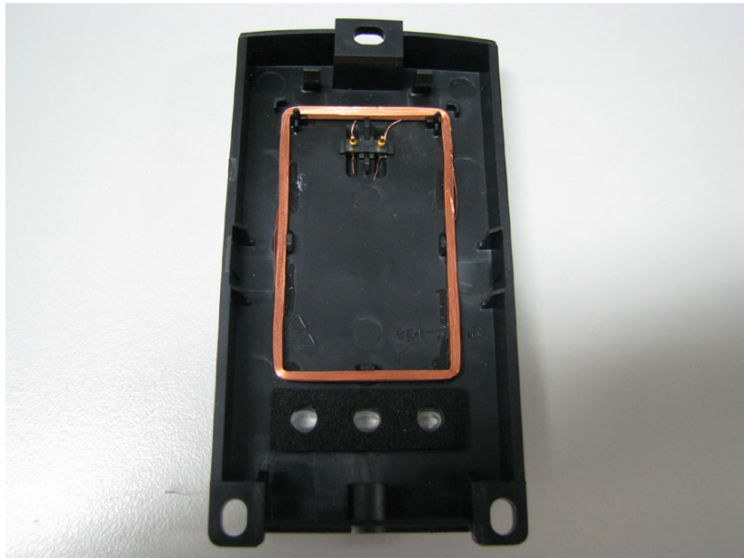
Reader housing/coil sub assembly