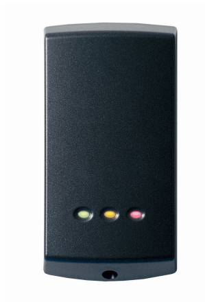
Front view – with cover on