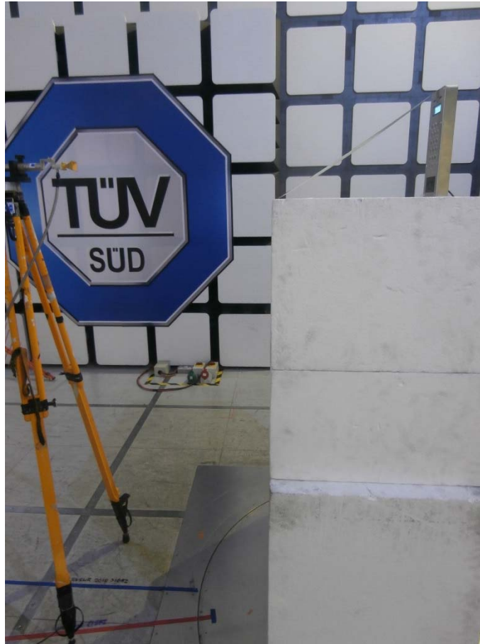
Radiated Emissions 18 GHz to 25 GHz