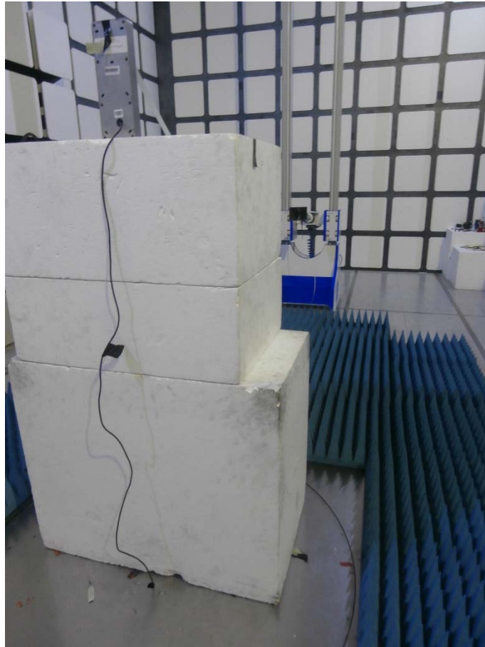
Radiated Emissions 1 GHz to 3 GHz