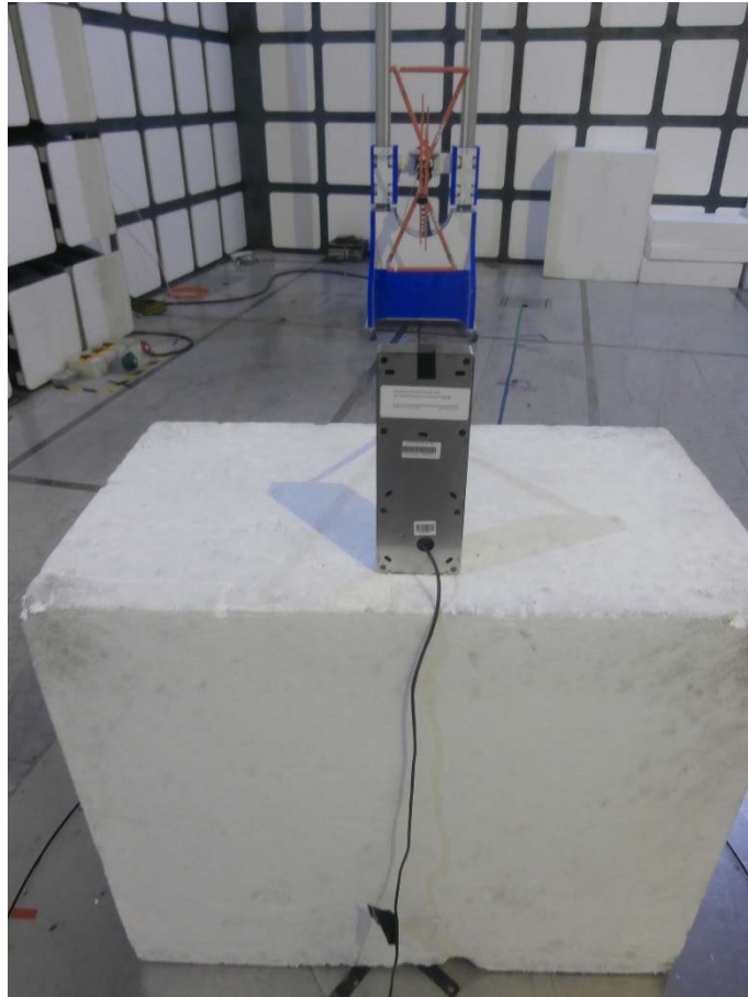
Radiated Emissions 30 MHz to 1 GHz