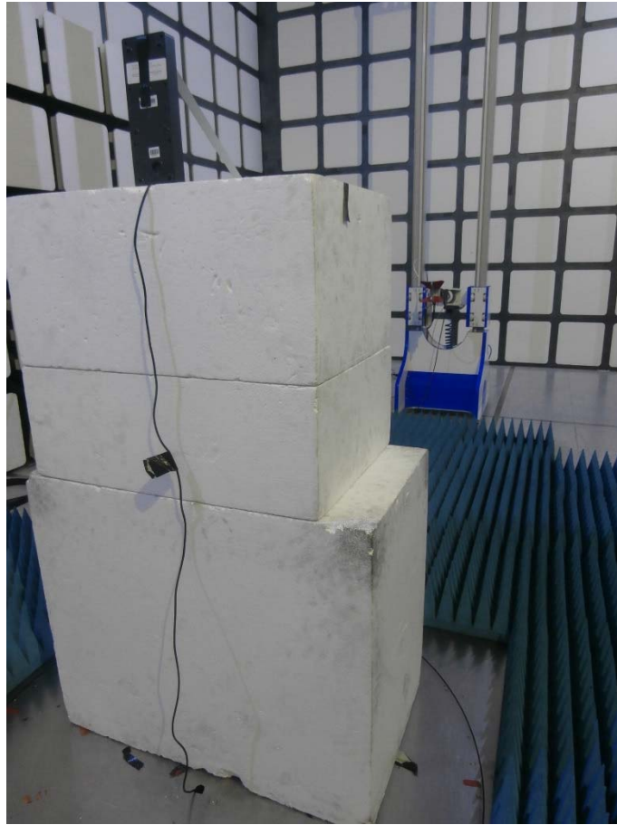
Radiated Emissions 3 GHz to 18 GHz