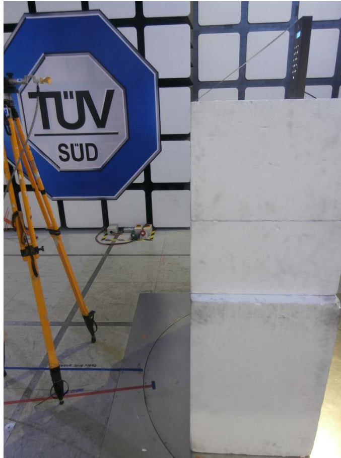
Radiated Emissions 18 GHz to 25 GHz