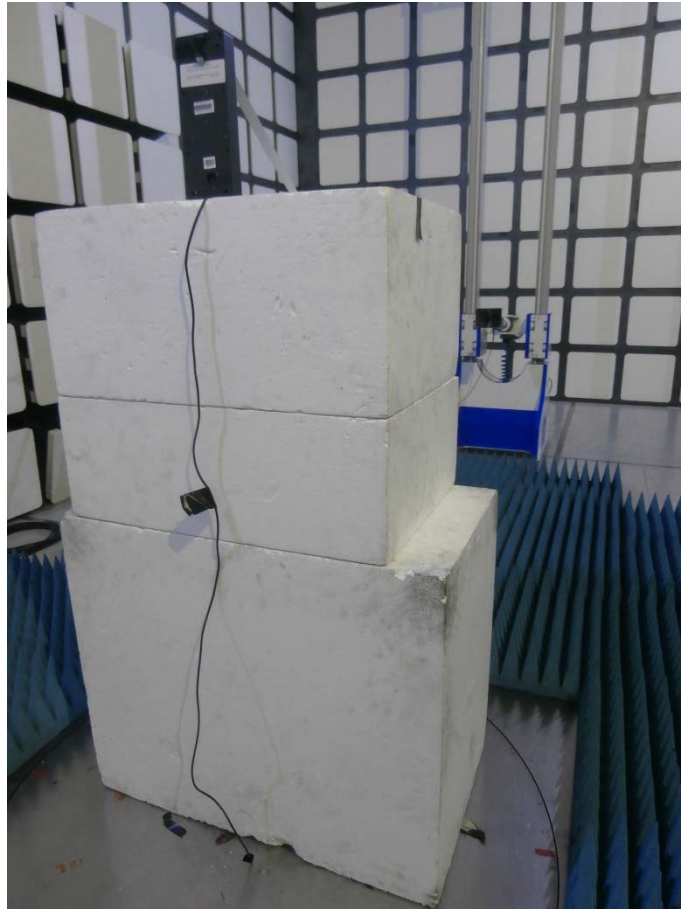
Radiated Emissions 1 GHz to 3 GHz