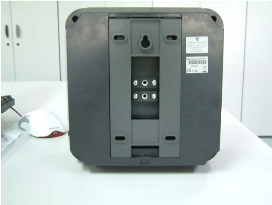
Rear view (with mounting backplate)