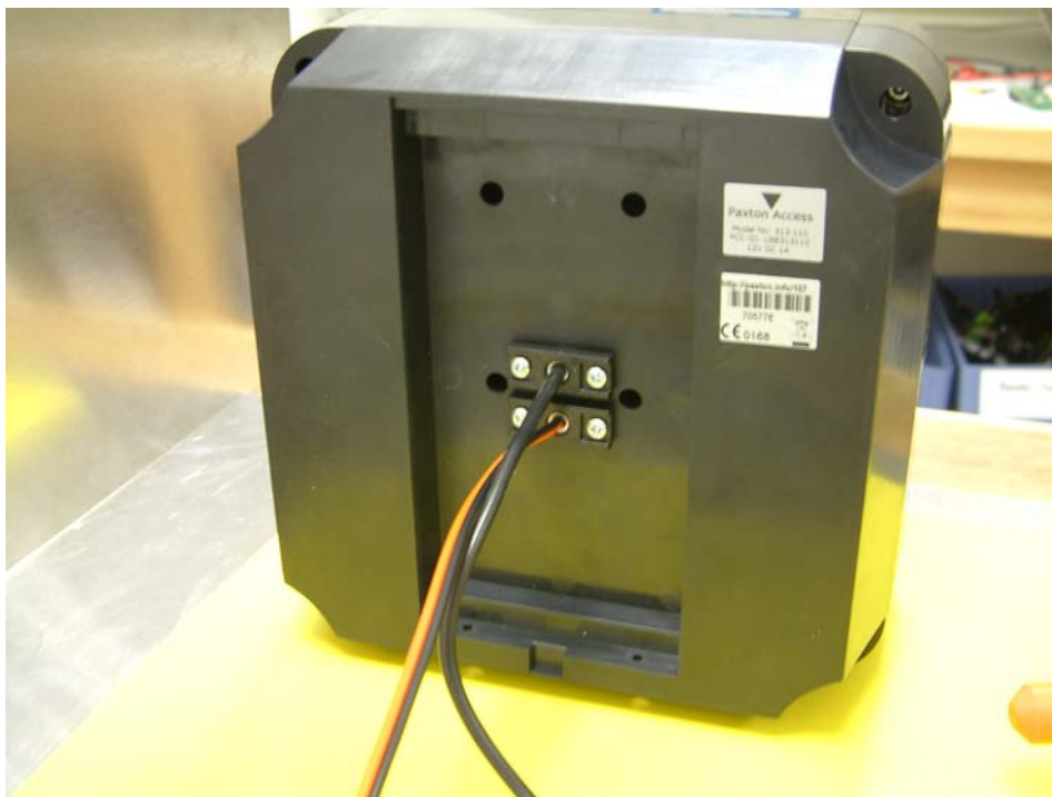
Rear view (without mounting backplate, showing cables)