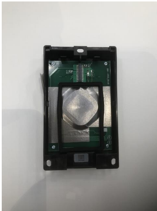
Photo 6. Back View, with main PCB removed