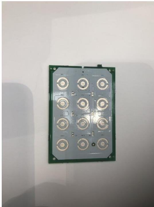
Photo 2. Front PCB Top, keypad array