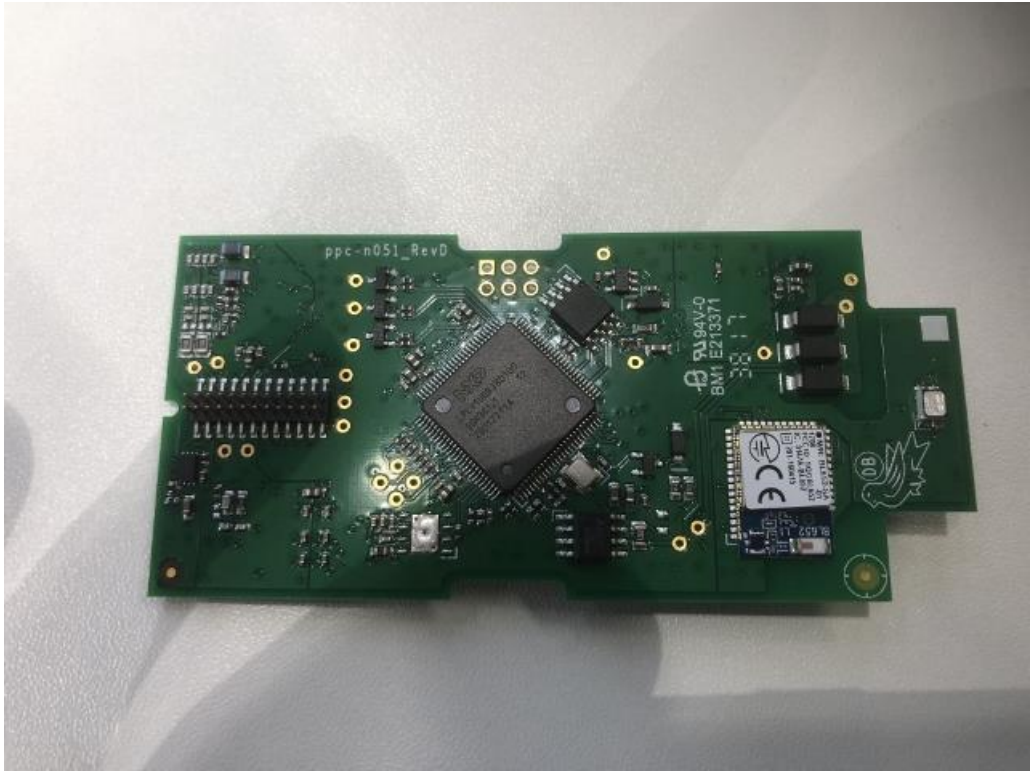
Photo 3. Main PCB Top View