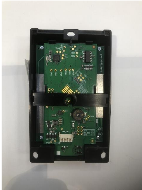
Photo 5. Back View, unpotted